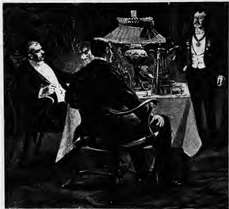
The distinguished Major appeared in full evening dress.