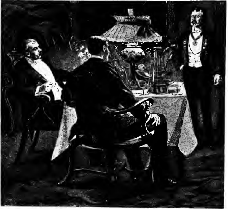
The distinguished Major appeared in full evening dress.