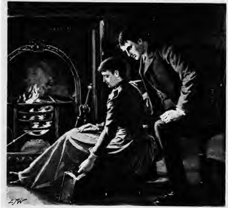
Beside the Hearth.