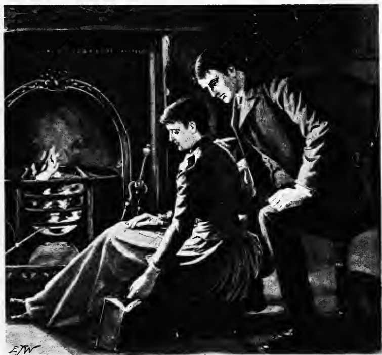
Beside the Hearth.