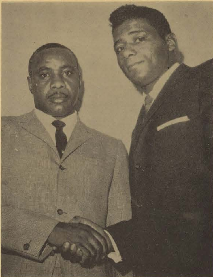
Floyd Patterson, heavyweight champion of the world, right, shakes hands for the first time with the leading contender for his title, Sonny Liston. Note the size of Liston's much publicized fist. The grimness with which they greeted each other could foretell the type of fight a meeting between these two ring stalwarts might produce.