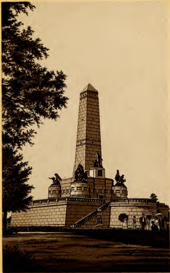
NATIONAL LINCOLN MONUMENT.