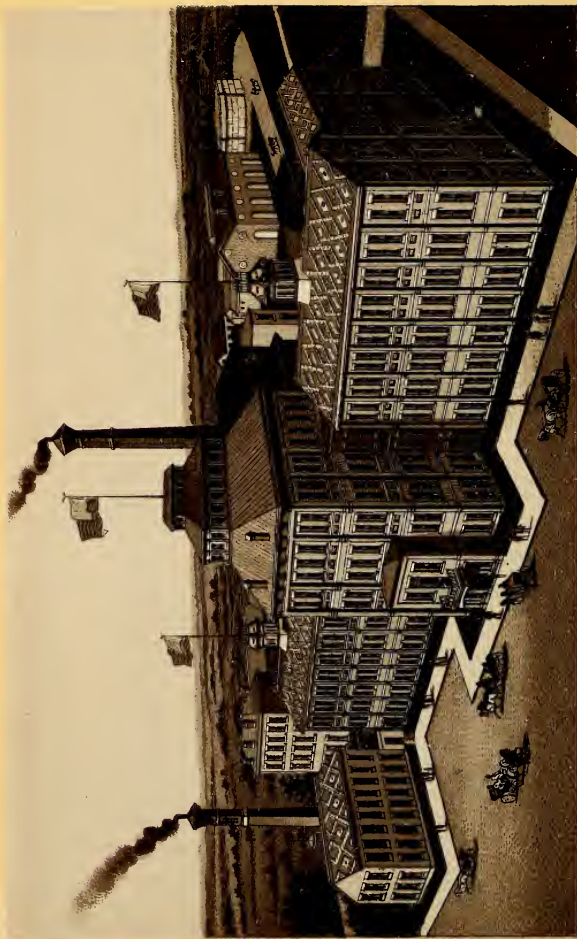
ILLINOIS WATCH COMPANY. FACTORY AT SPRINGFIELD, ILLINOIS.