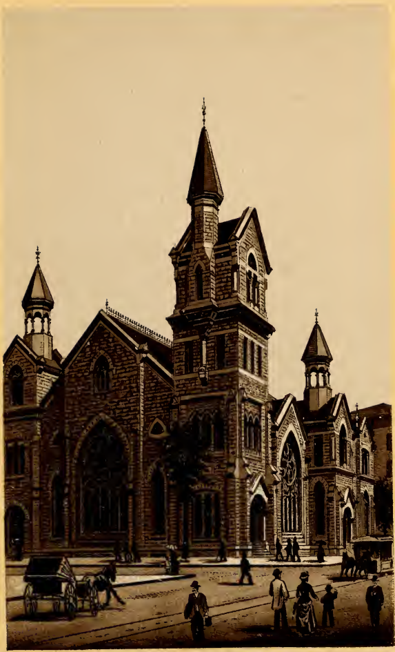
FIRST M.E. CHURCH.