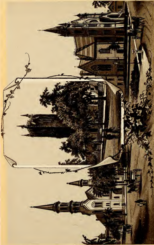
FIRST PRESB. CHURCH, ST. PAUL'S EPISC. CHURCH. CHRISTIAN CHURCH.