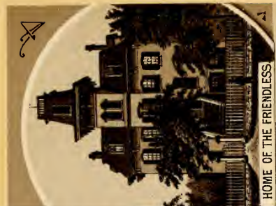
HOME OF THE FRIENDLESS