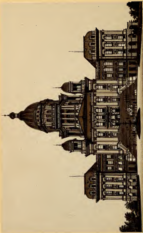
ILLINOIS STATE CAPITOL.