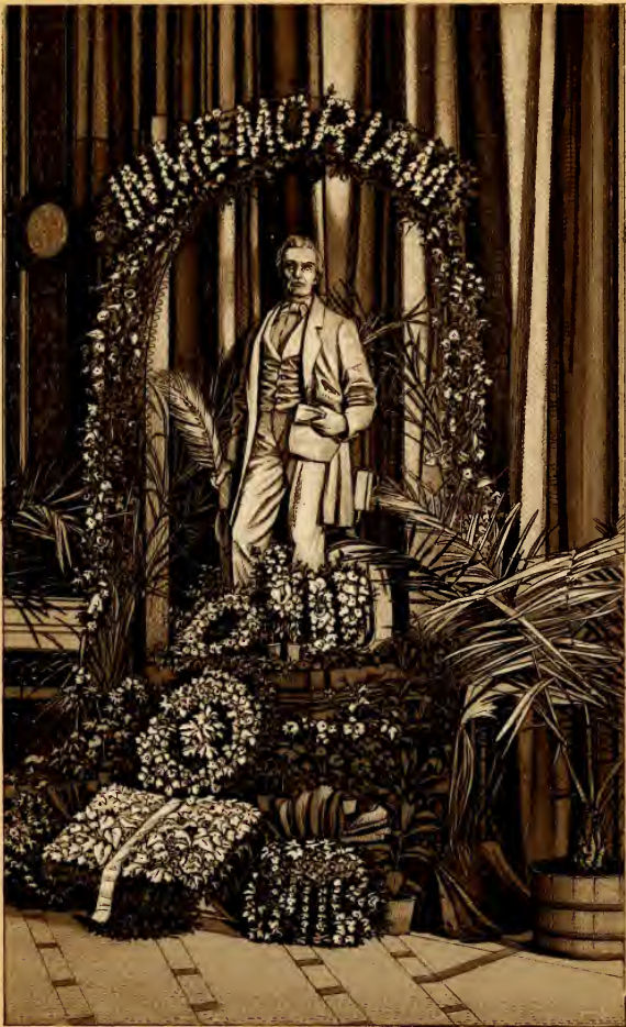
LINCOLN STATUE IN STATE CAPITOL. AT THE 20 TH ANNIVERSARY OF HIS DEATH, APRIL 15 TH 1865.