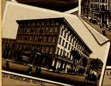
ST NICHOLAS HOTEL