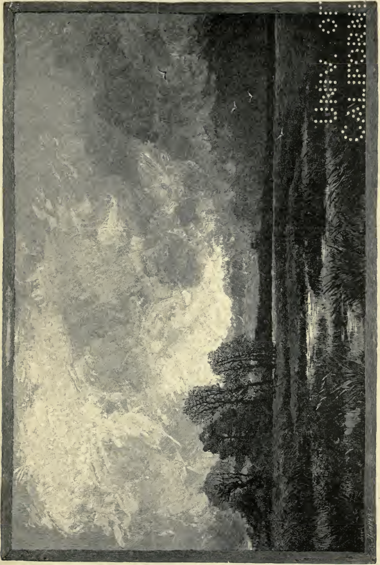
"SPRING IN NEW ENGLAND." Page 206.