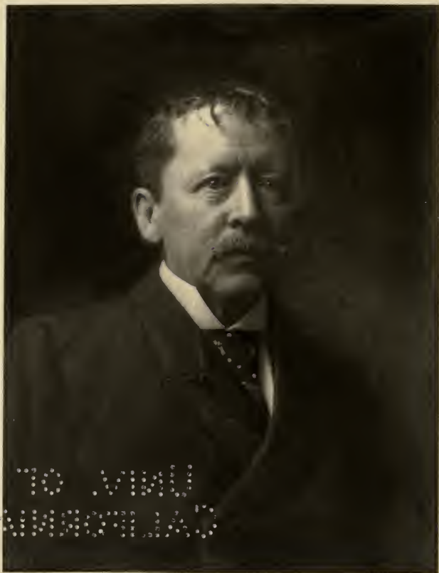
Thomas Bailey Alorich.