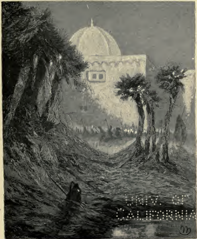
"WHEN THE SULTAN GOES TO ISPAHAN." Page 66.