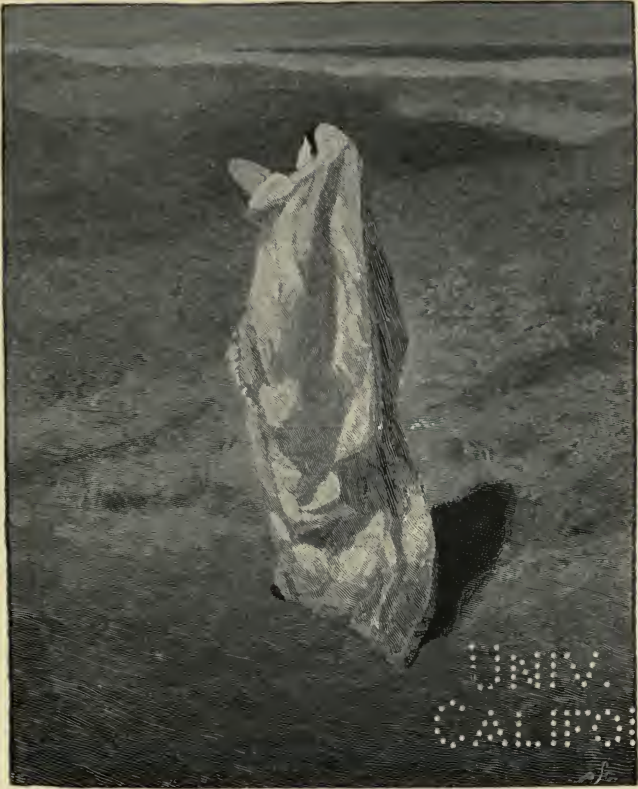
“JUDITH.” Page 316.