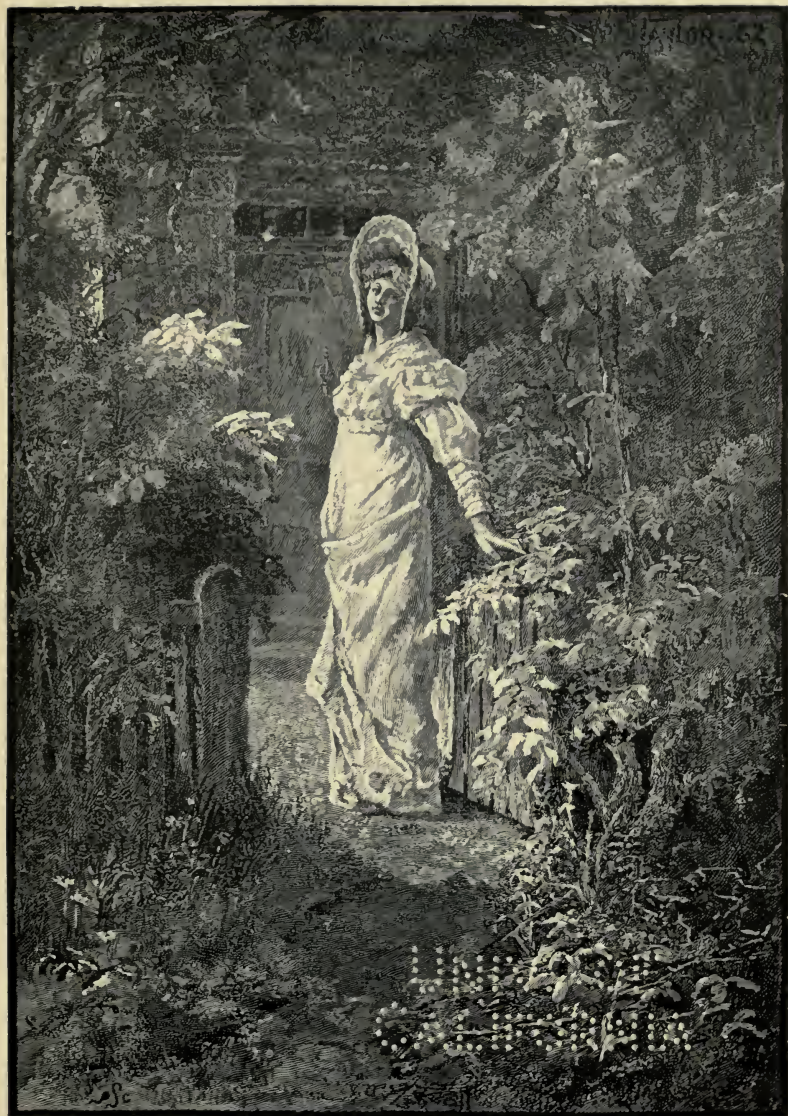
"THE QUEEN'S RIDE." Page 22.