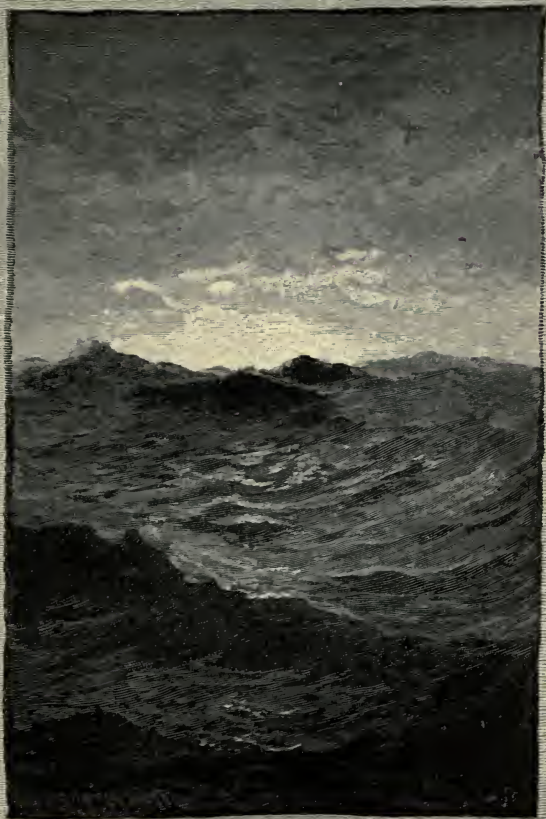
“MOONRISE AT SEA.” Page 200.