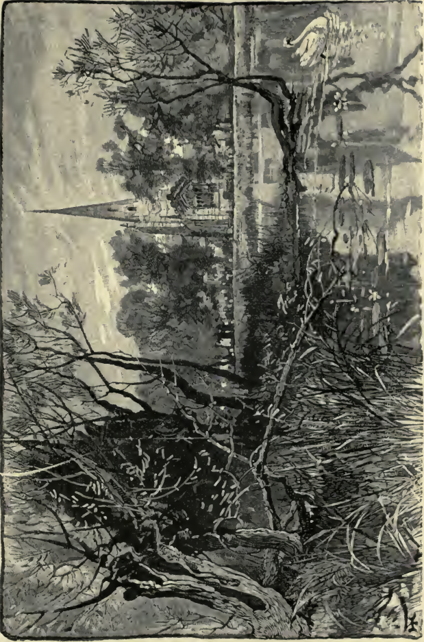
"THE RIVER AVON." Page 391.