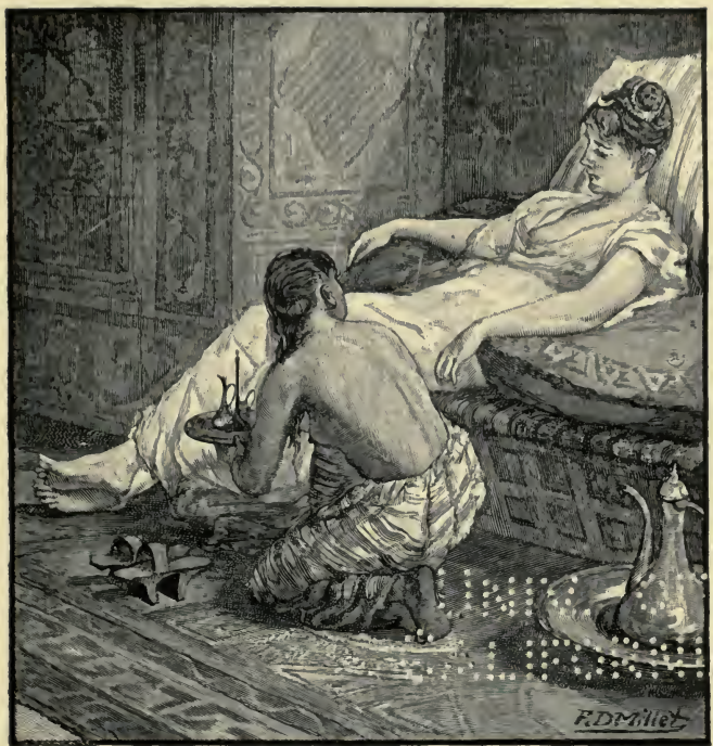
"DRESSING THE BRIDE." Page 58.