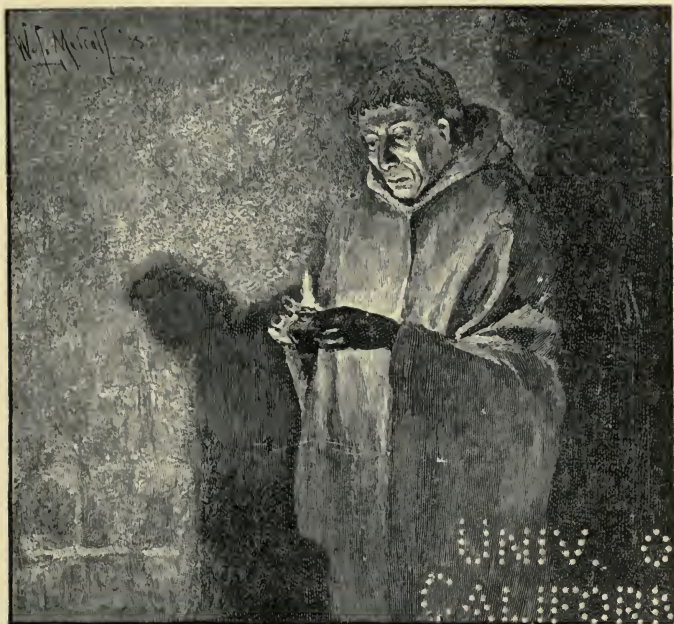
"FRIAR JEROME." Page 82.