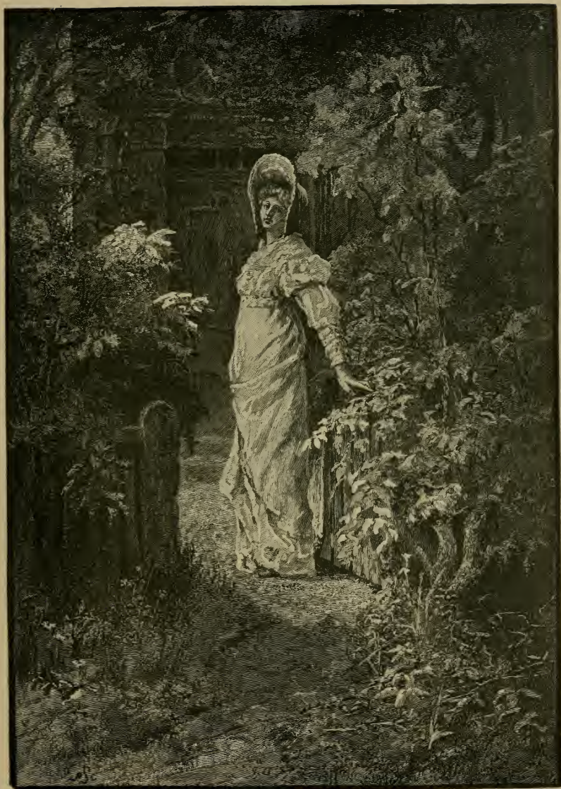
"THE QUEEN'S RIDE" Page 98.