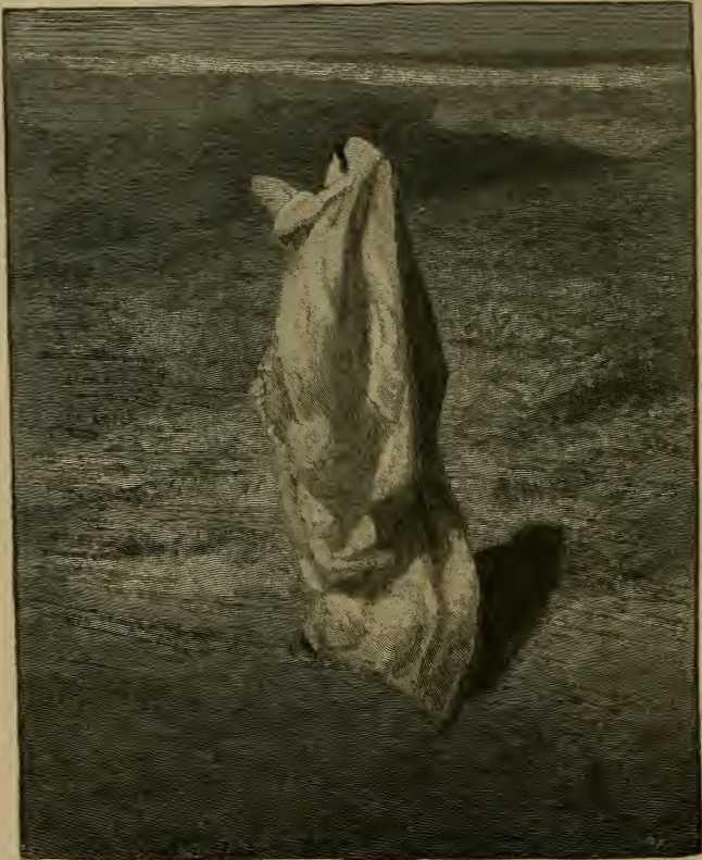
"JUDITH." Page 173.