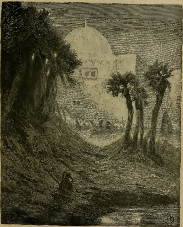
"WHEN THE SULTAN GOES TO ISPAHAN." Page 28.