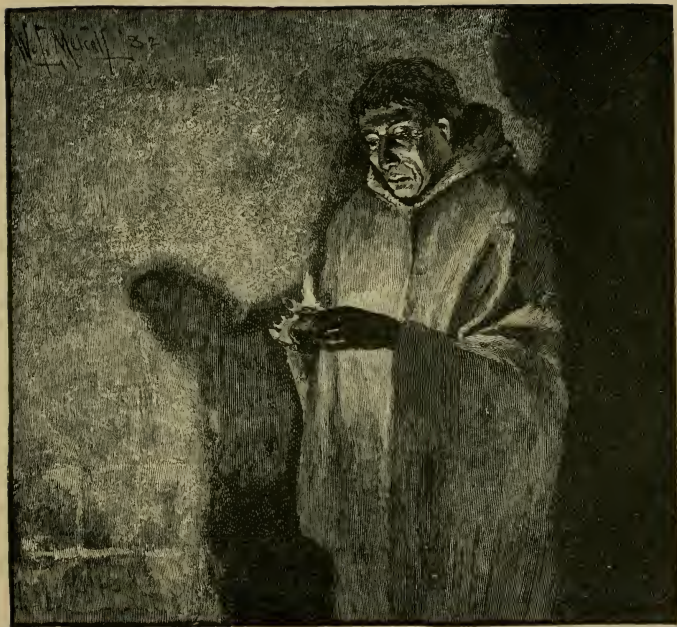
"FRIAR JEROME " Page 116.