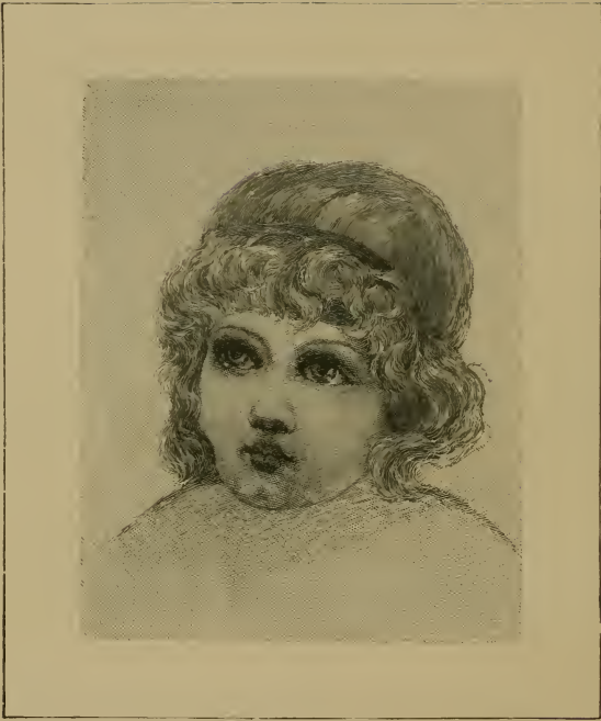
"BABY BELL." Page 73.