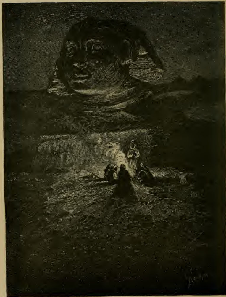
"EGYPT." Page 203.