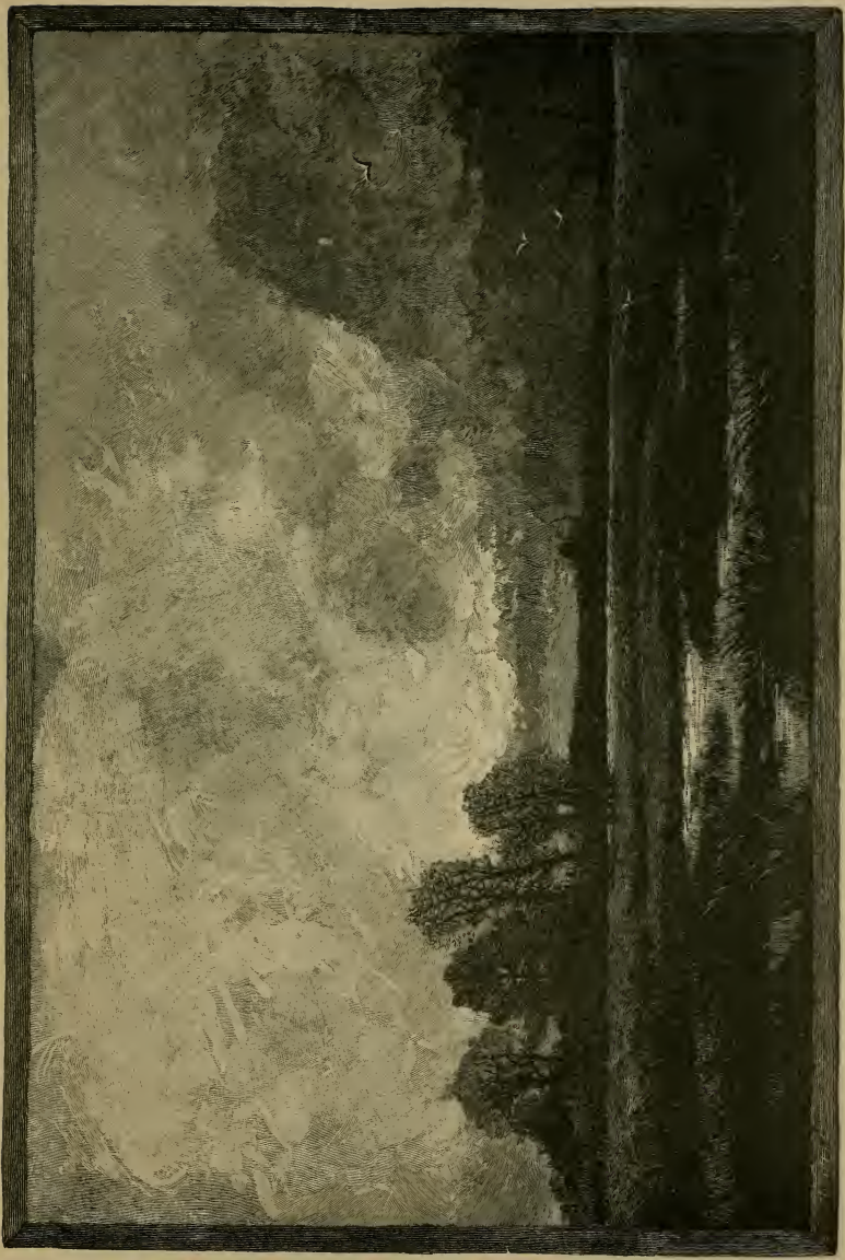
"SPRING IN NEW ENGLAND." Page 68.