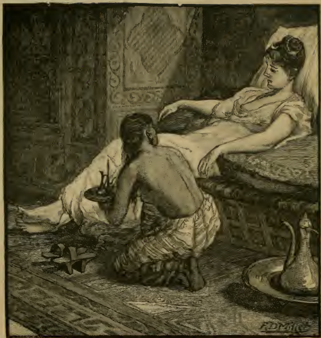
"DRESSING THE BRIDE." Page 21.