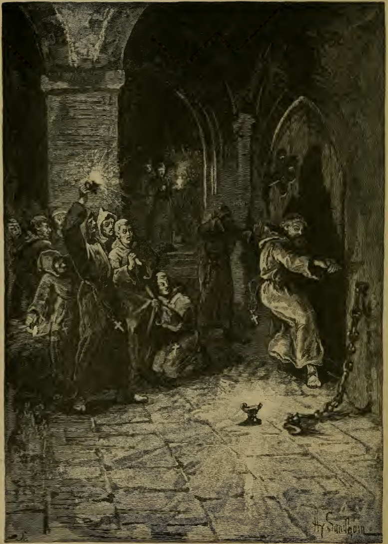
"LEGEND OF ARA-CŒLI," Page 163.