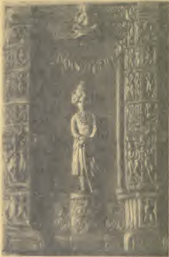
THE MAHARAJ KUNWAR