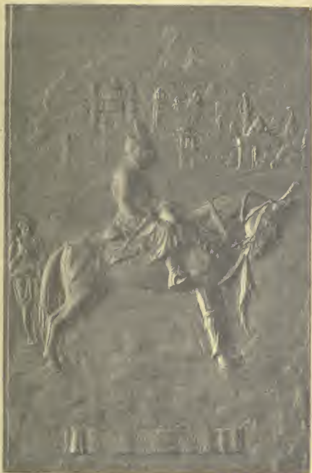
THE MAHARAJAH WATCHED THE BATTLE