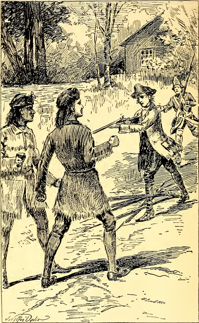
“Wheel about, and march back to the house, or I shall shoot,” said the Tory. Page 153.