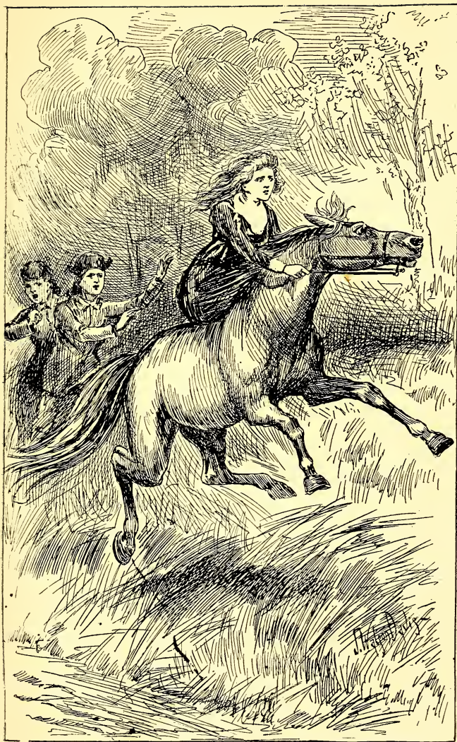
The colt darted forward at full speed with Mrs Dillard. —Page 113.