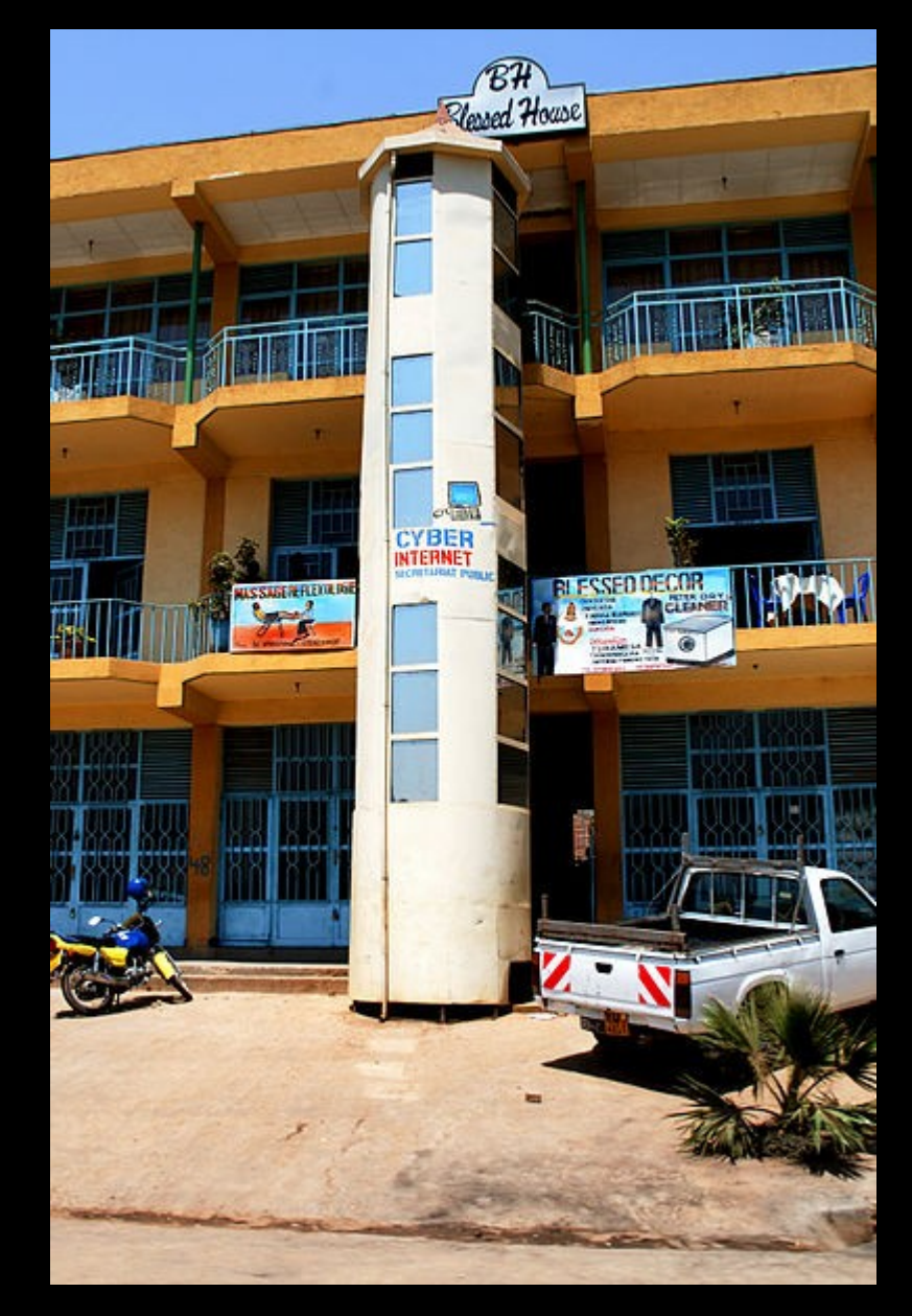
File:Cybercafe in kigali.jpg, Moongateclimber, CC-BY-SA