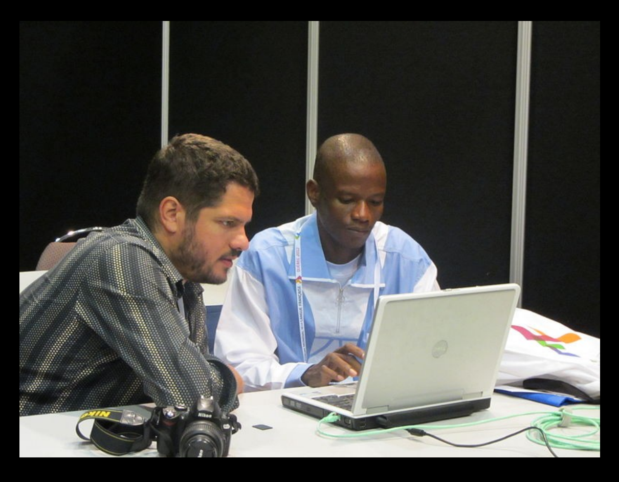
File:FMLF 2012-5.JPG