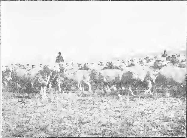
TRAILED ALL THE WAY FROM NEW MEXICO