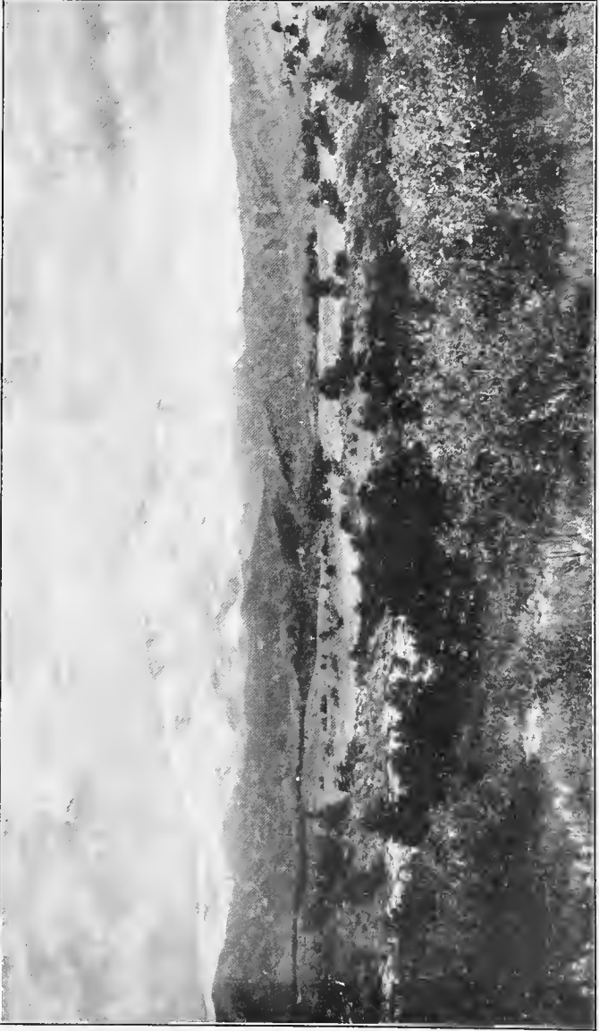
PIKE'S PEAK FROM THE OLD RANCH