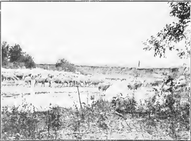
LIKE A SOLITARY FENCE POST