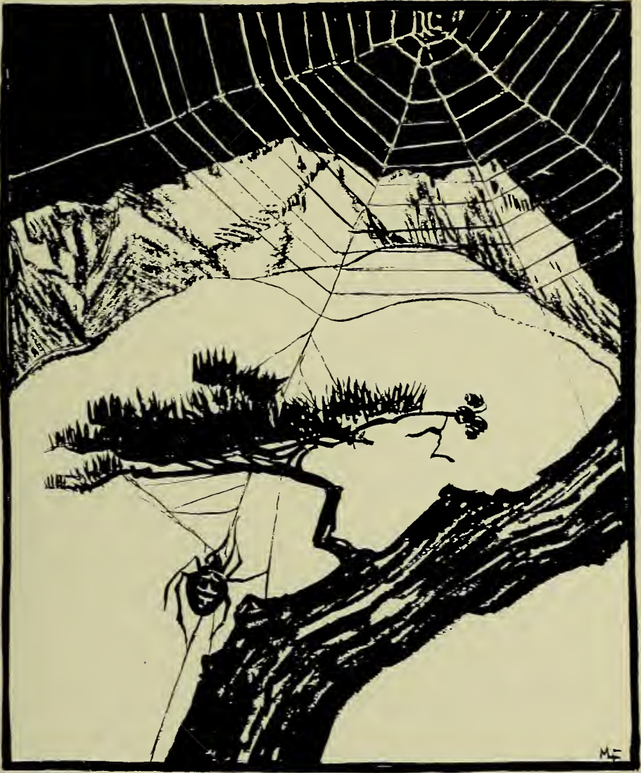
HE SAID FAREWELL TO THE SKY COUNTRY AND LET HIMSELF DOWN TO EARTH—BY ONE OF HIS OWN STRANDS OF YARN