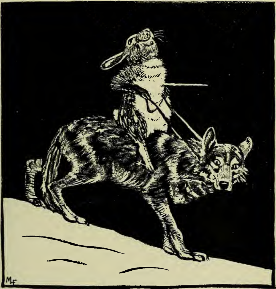
WOLF TROTTED ALONG LIKE A LITTLE HORSE, AND RABBIT LAUGHING TO HIMSELF SITTING IN THE SADDLE