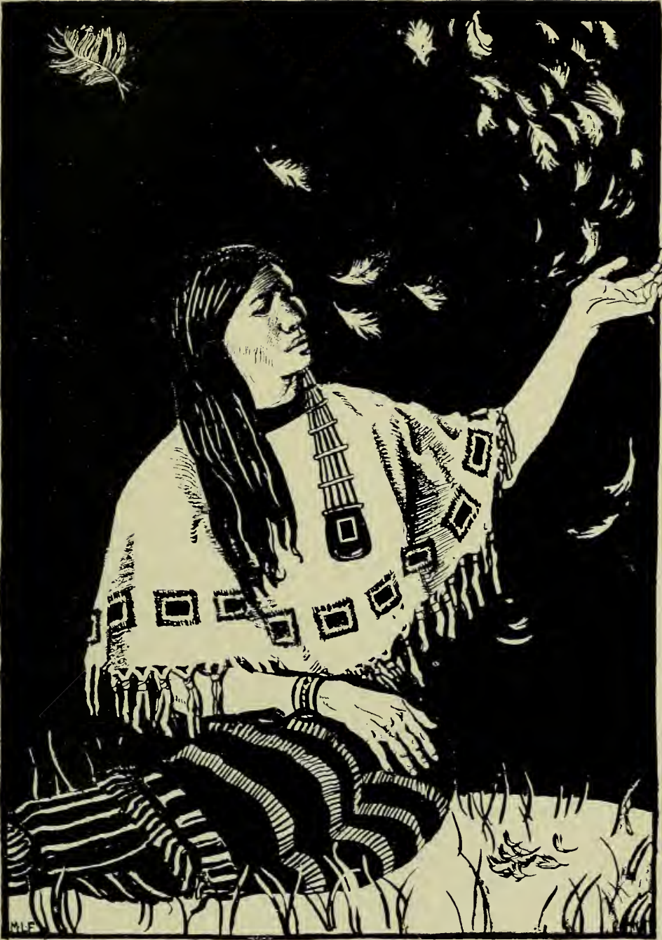
AND SHE MAKES TO HIM AN OFFERING OF TINY WHITE FEATHERS PLUCKED FROM THE BREASTS OF BIRDS