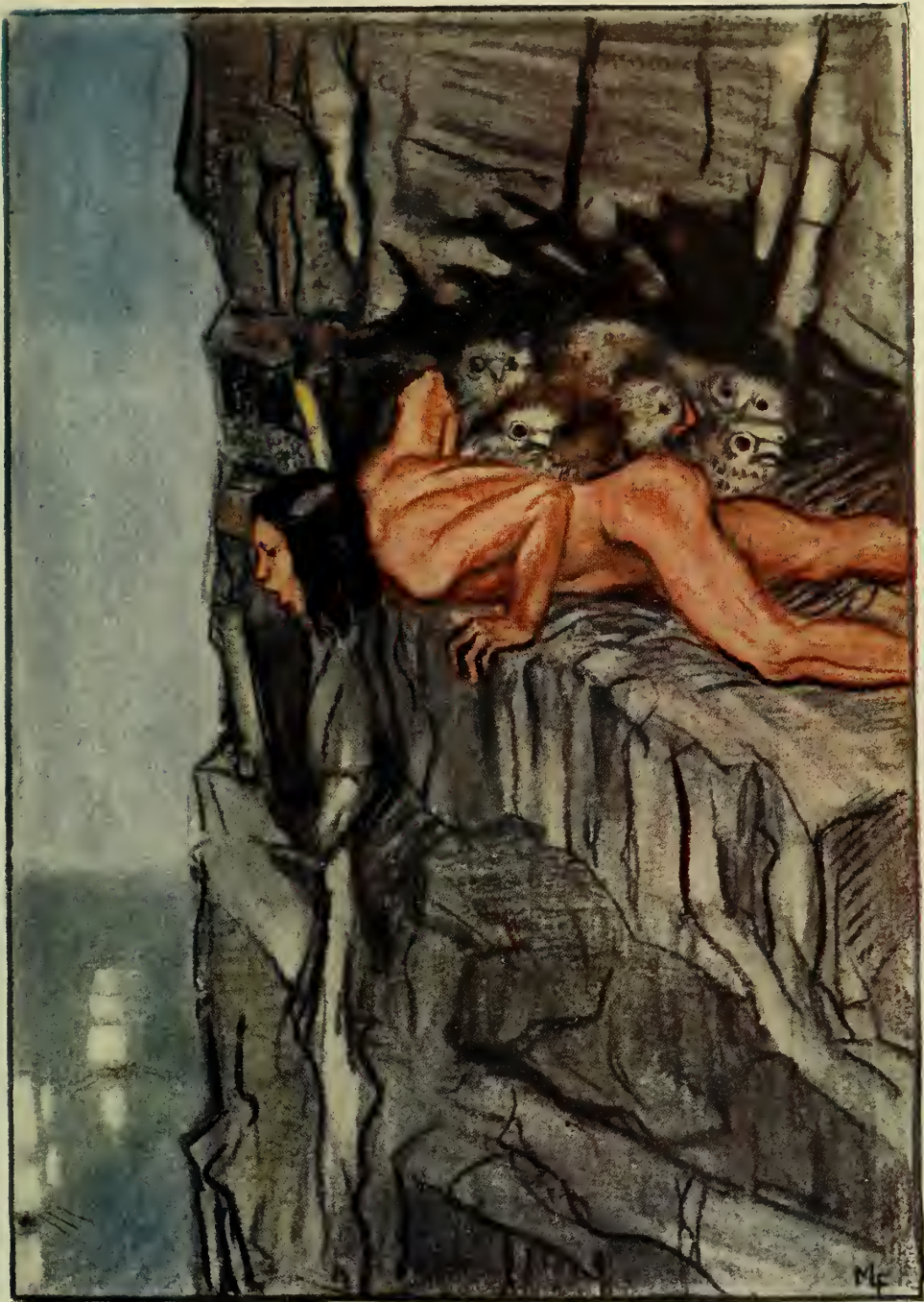
FOR SOME DAYS THE BOY LAY IN TERROR IN THE NEST . . . AND FAR OUT ON THE OCEAN HE COULD SEE GREAT SHIPS GOING BY