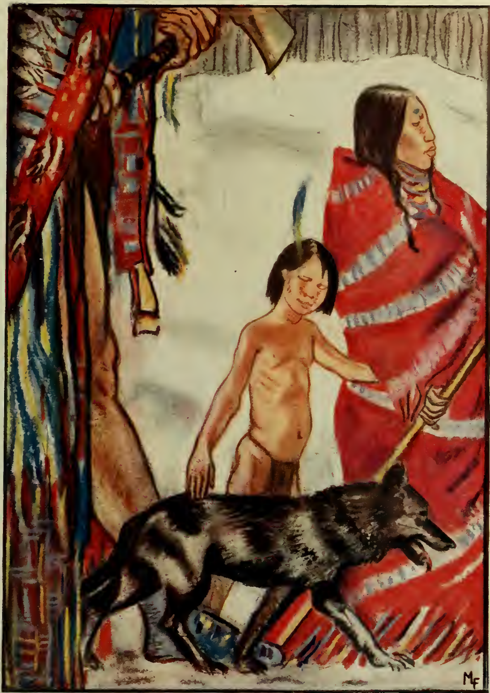
THE GIANT FROWNING ANGRILY, THE WOMAN CARRY- ING THE STICK AND THE BOY LEADING THE DOG