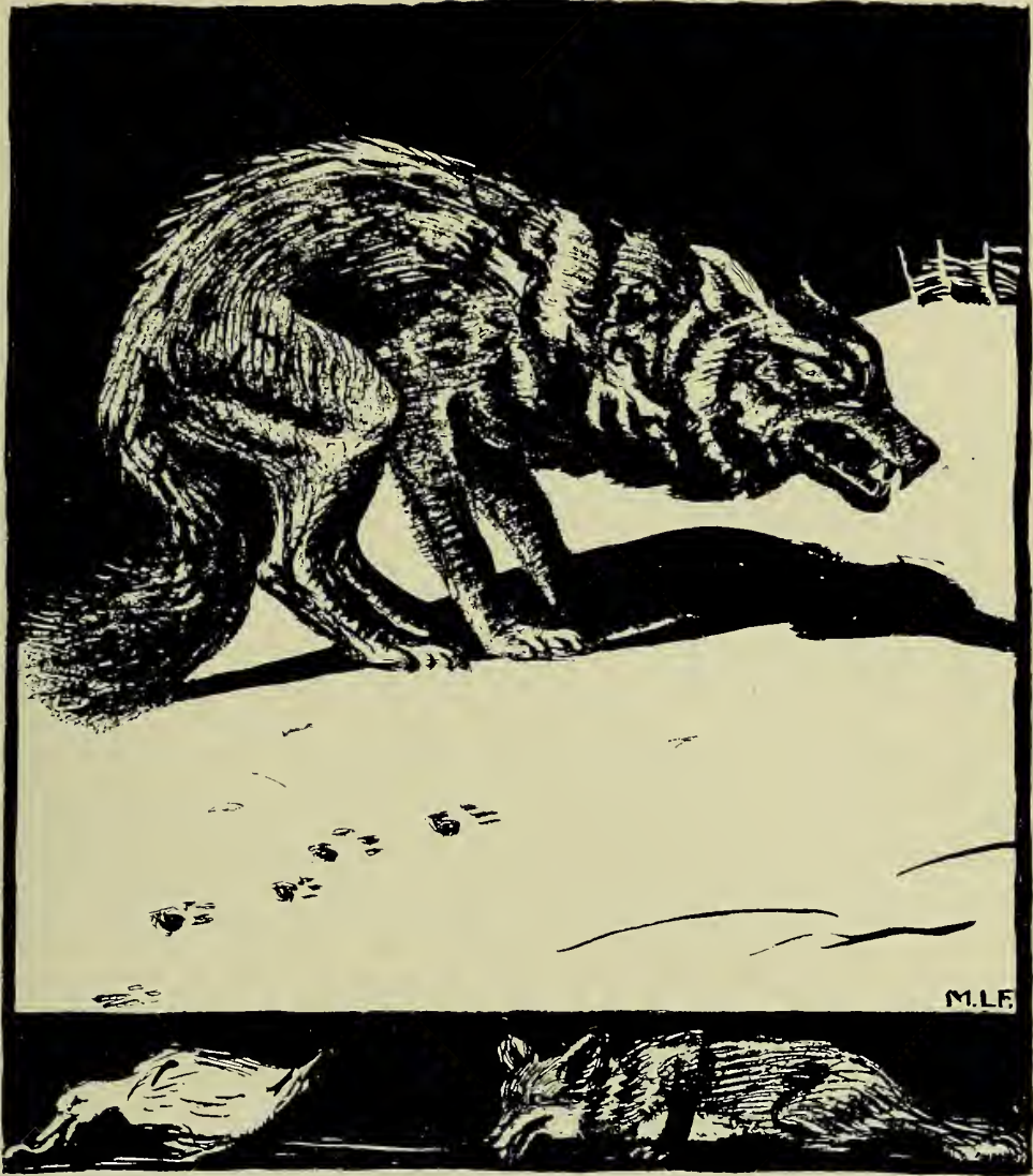
THAT NIGHT AN OLD WOLF CAME THROUGH THE FOREST IN SEARCH OF FOOD