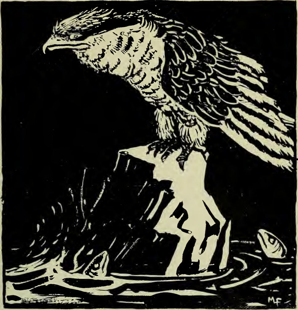
AND WITH HIS MAGIC POWER HE CHANGED HER INTO A FISH-HAWK AND SENT HER OUT TO THE OCEAN