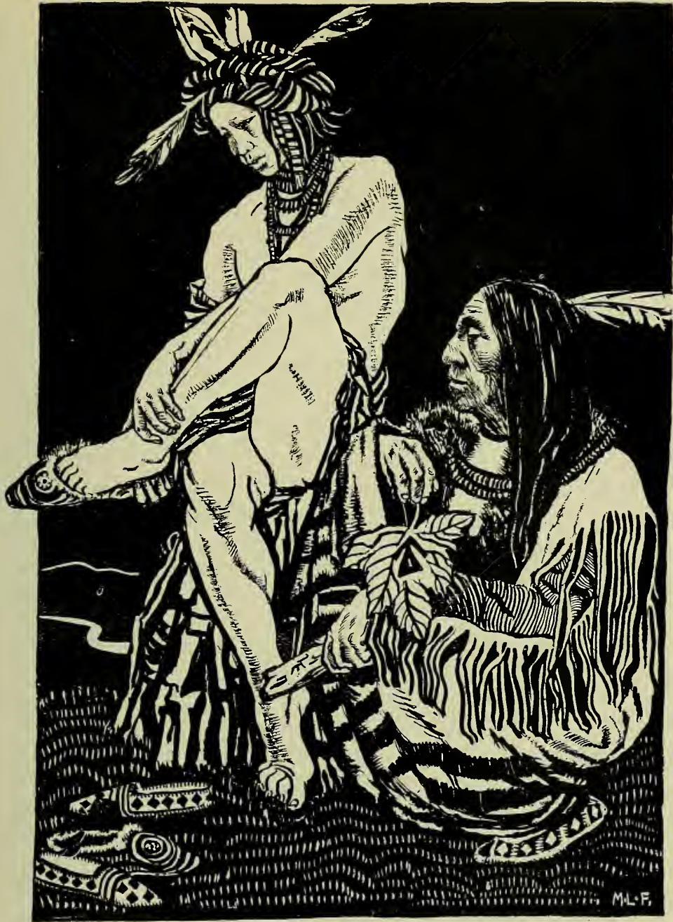
THE MAN GAVE HIM ANOTHER PAIR OF MOCCASINS IN EXCHANGE FOR THOSE HE WAS WEARING