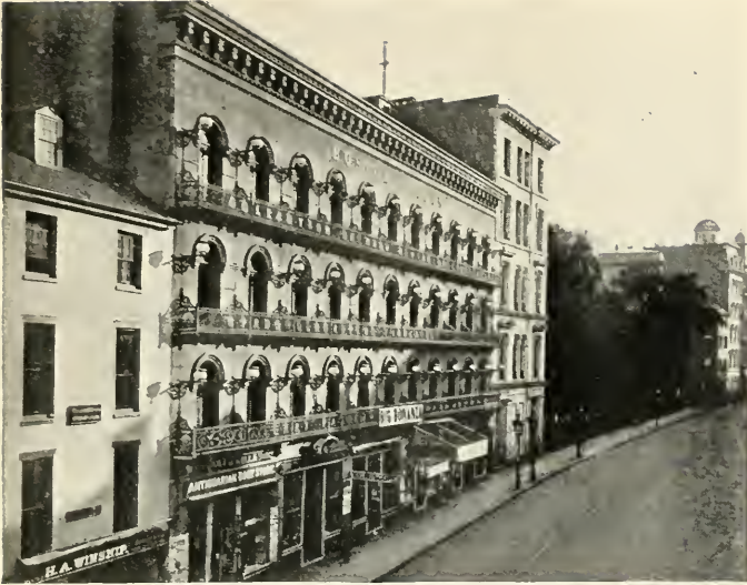
The Boston Museum in 1876