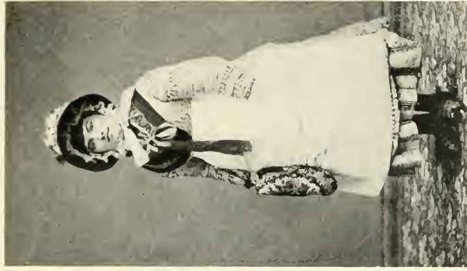
Lizzie Harold as Little Buttercup