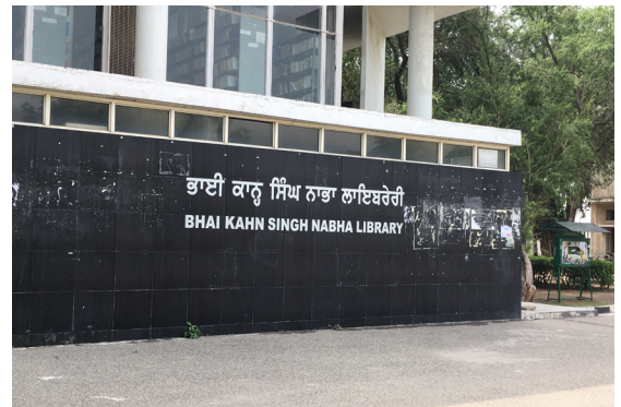
The college canteen is where Sukhwinder catches up with his friends.