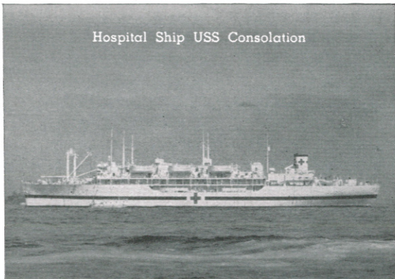
Hospital Ship USS Consolation

You find the Navy everywhere — at home, abroad — on land, sea, and in the air. And everywhere the Navy goes, it takes its Nurses. So when you're a Navy Nurse, you