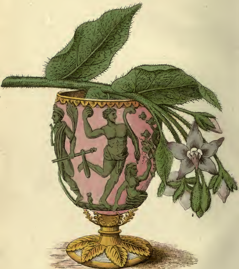
SPRIG OF BORAGE IN GLASS CUP OF THE THIRD OR FOURTH CENTURY.