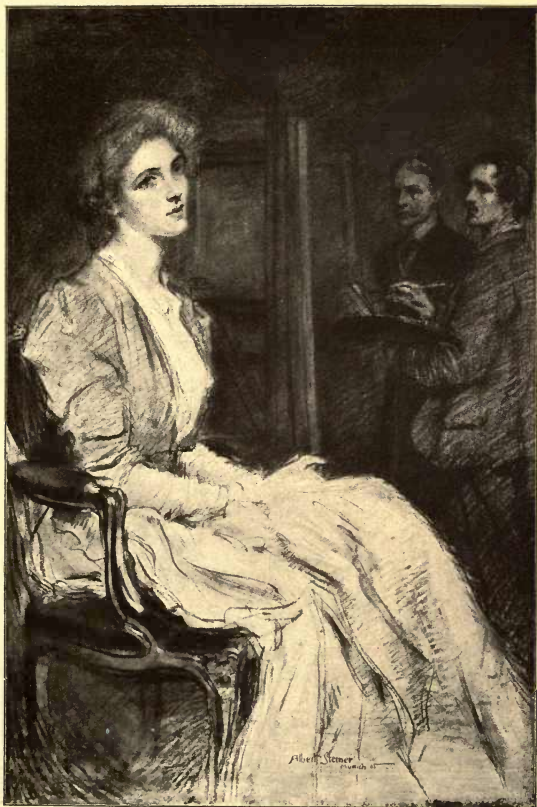
"MADAME DE PASTOURELLES SAT AS STILL AS SHE COULD, HER THIN, NUMBED FINGERS LIGHTLY CROSSED ON HER LAP."