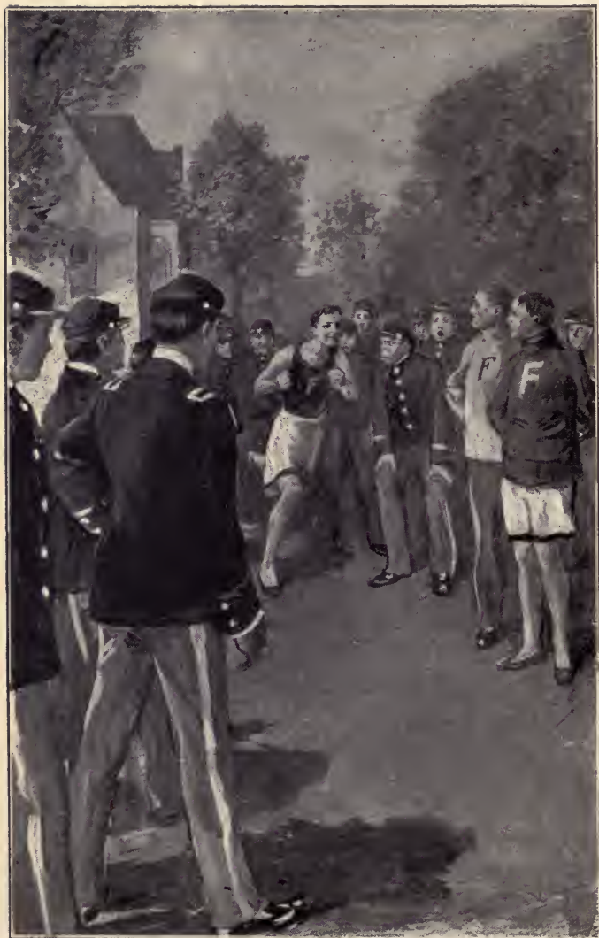
"All eyes were now fixed on Frank." See page 118.