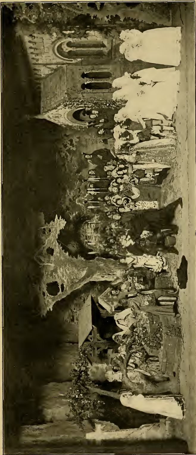
“THE DEVIL TAKE THY SOUL.”