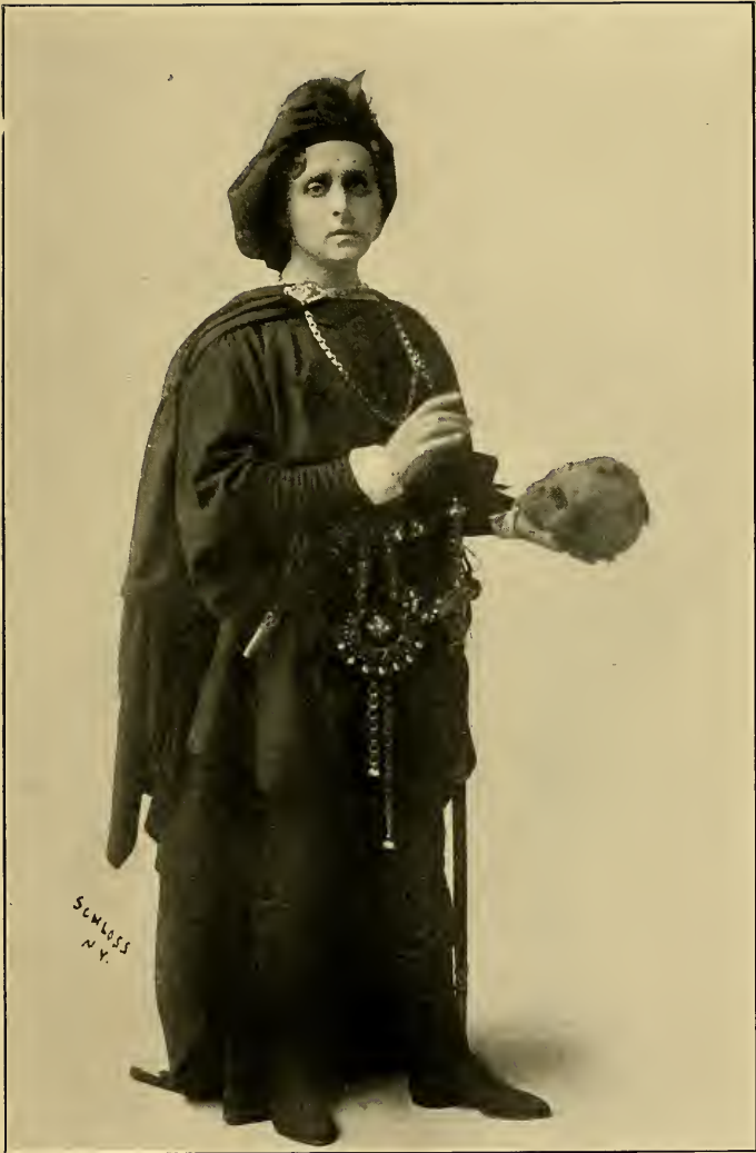
"ALAS, POOR YORICK!"