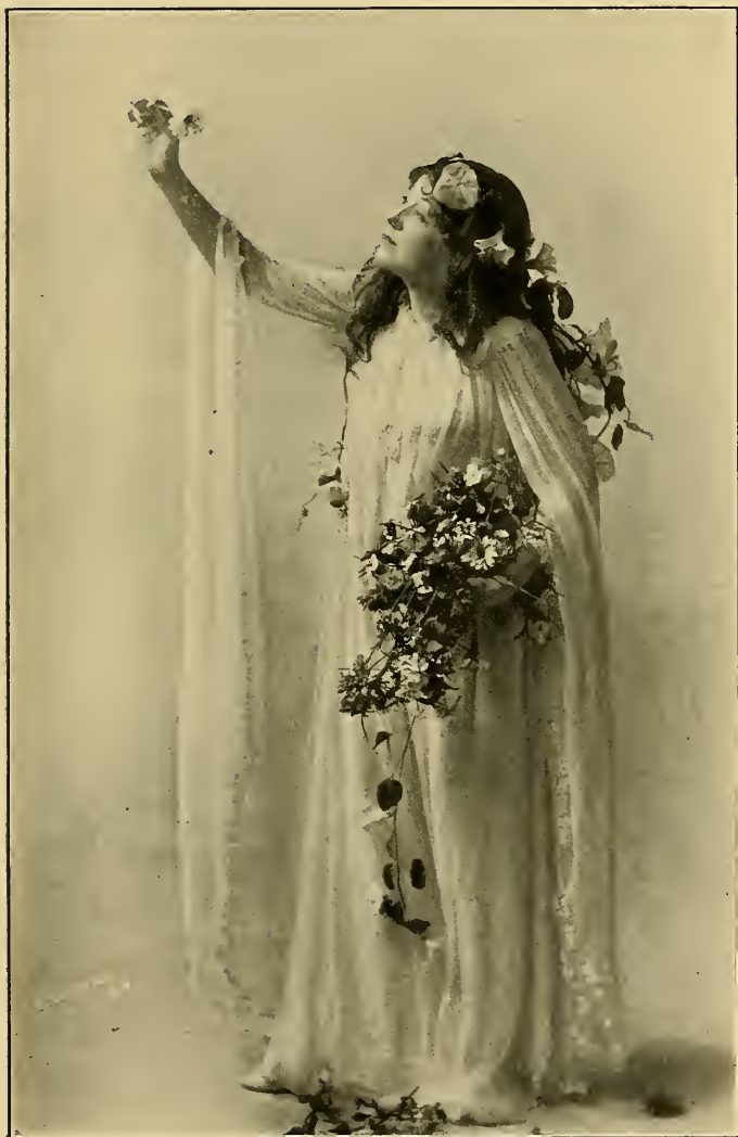
"THERE'S A DAISY!"