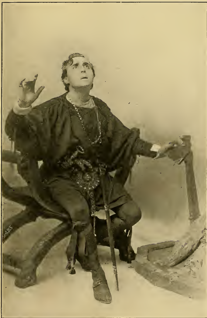
“THE UNDISCOVERED COUNTRY FROM WHOSE BOURN NO TRAVELLER RETURNS.”