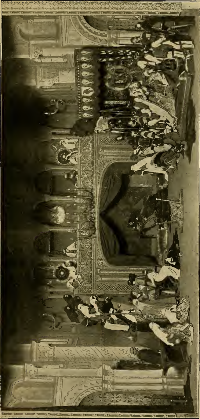
“WHAT DO YOU CALL THE PLAY? THE MOUSE-TRAP.”