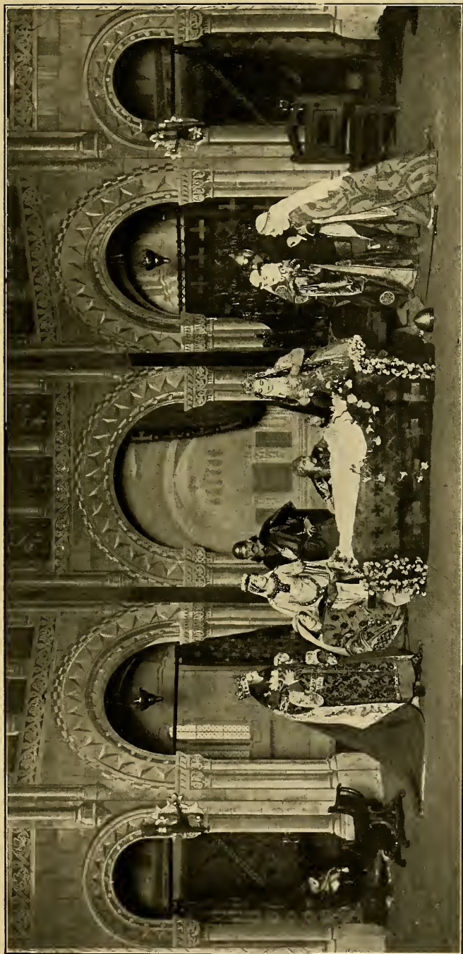
THERE, ON THE PENDENT BOUGHS HER CORONET WEEDS CLAMBERING TO HANG, AN ENVIOUS SLIVER BROKE; WHEN DOWN HER WEEDY TROPHIES AND HERSELF FELL IN THE WEeping BROOK."