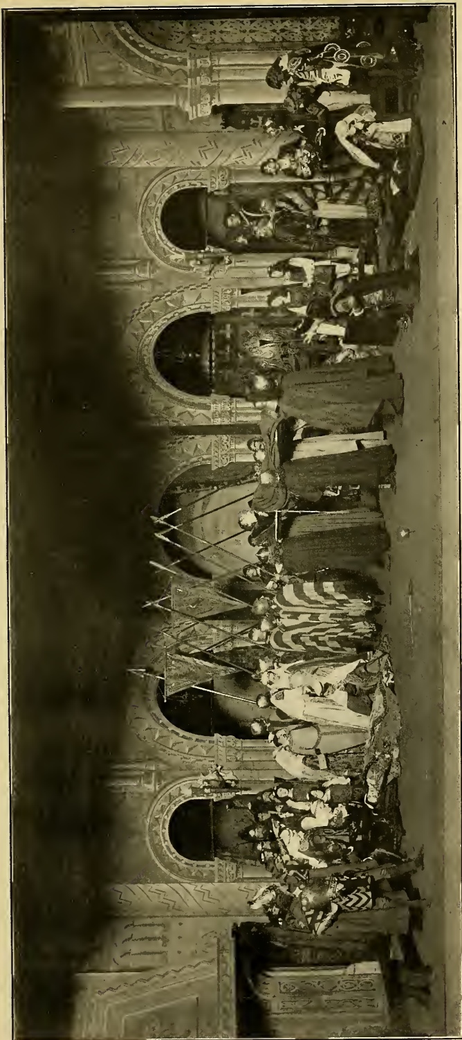
“BEAR HAMLET, LIKE A SOLDIER, TO THE STAGE.”