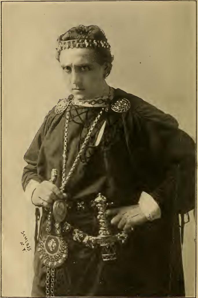
"TO BE OR NOT TO BE."