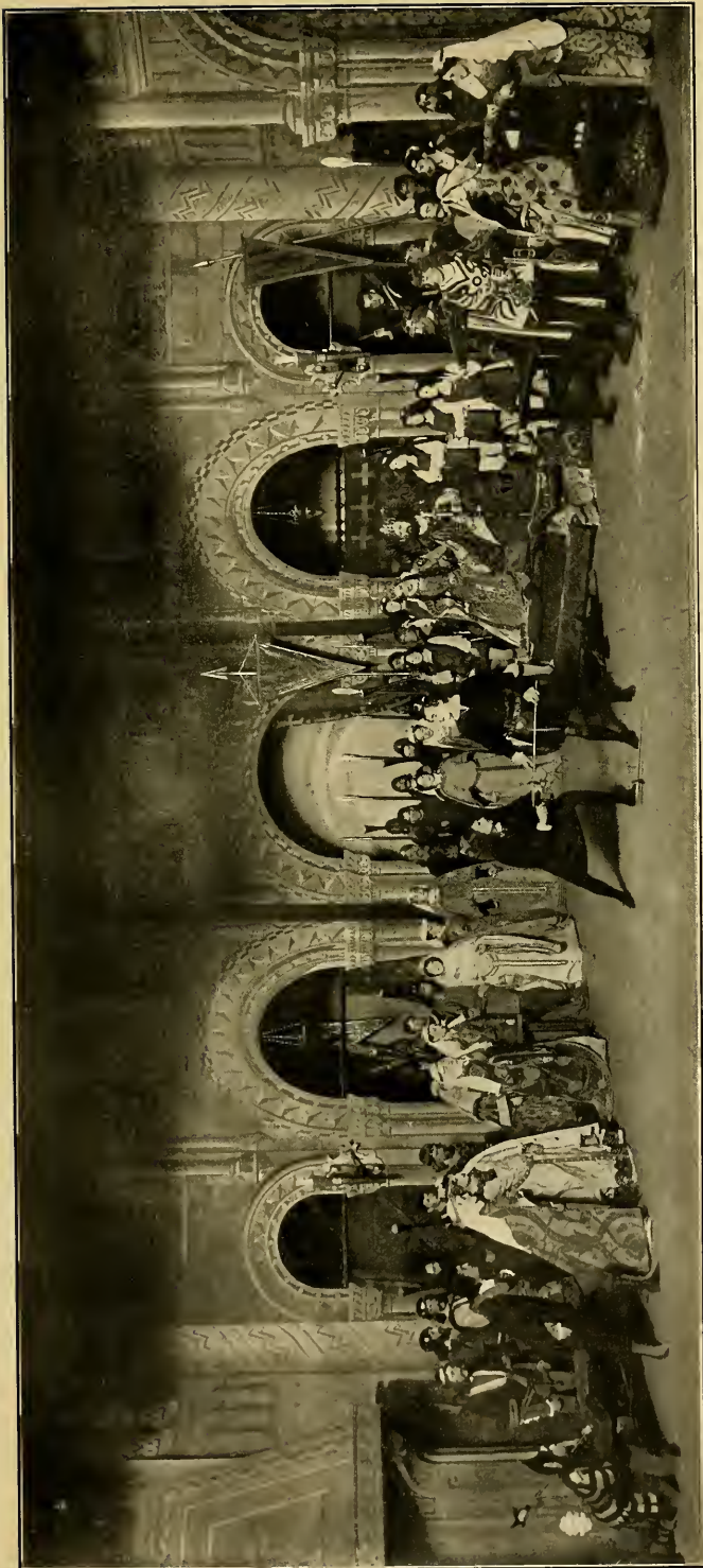
THE EXCHANGE OF THE FOILS.