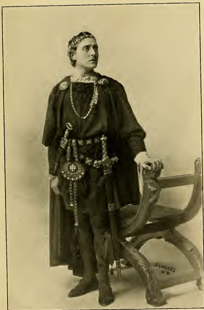
"I SHALL IN ALL MY BEST OBEY YOU, MADAM."