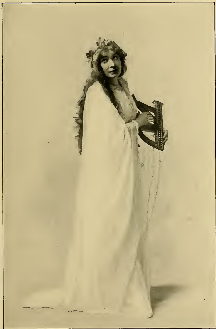
“HE IS DEAD AND GONE, LADY.”