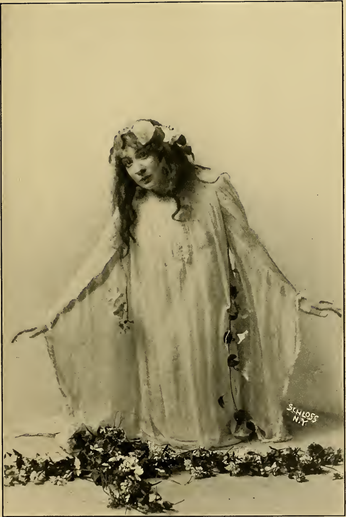
“ AT HIS HEAD A GRASS GREEN TURF, AT HIS FOOT A STONE.”