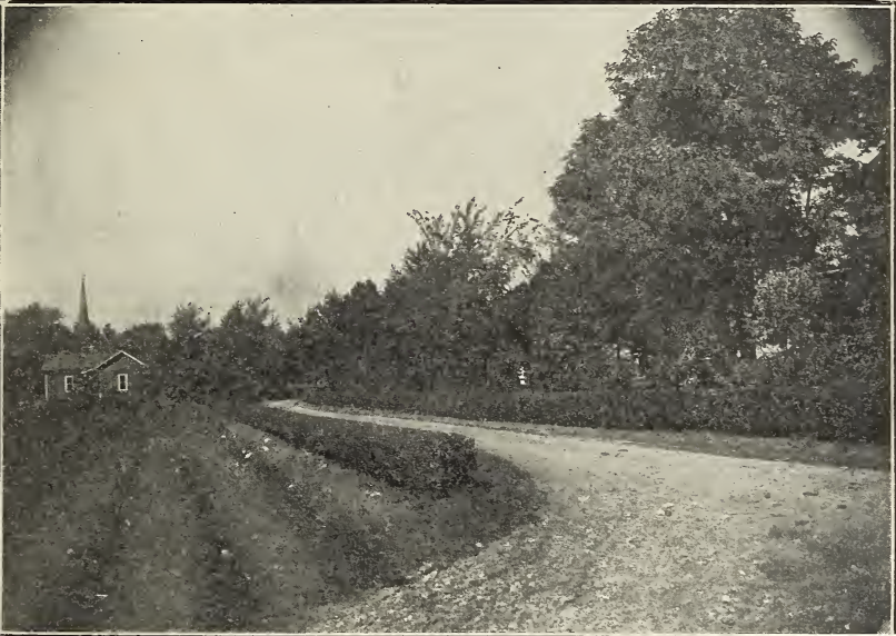
Privet Hedge and Driveway from Storage Buildings, New Haven Nurseries