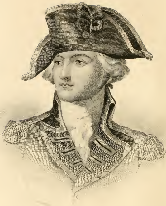
LT GEN. BURGOYNE