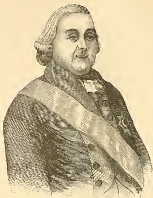
MAJ. GEN. FRIEDRICH ADOLPH RIEDESEL.