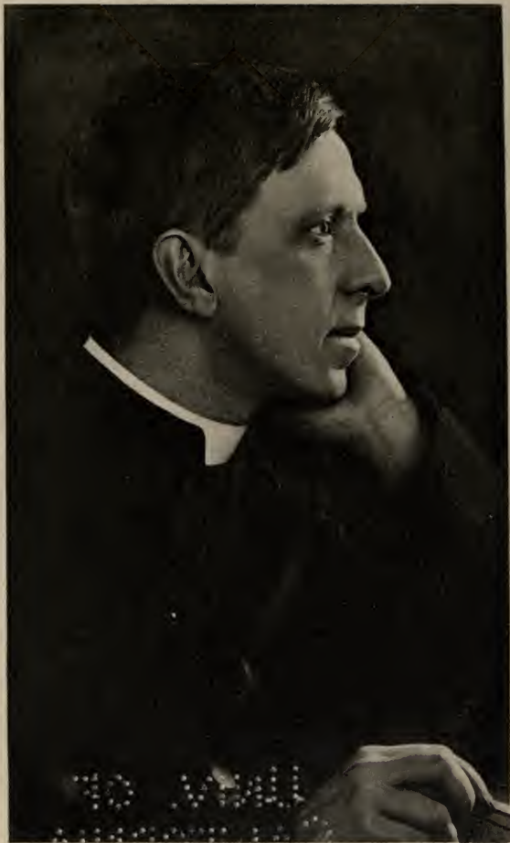
Robert Hugh Benson.