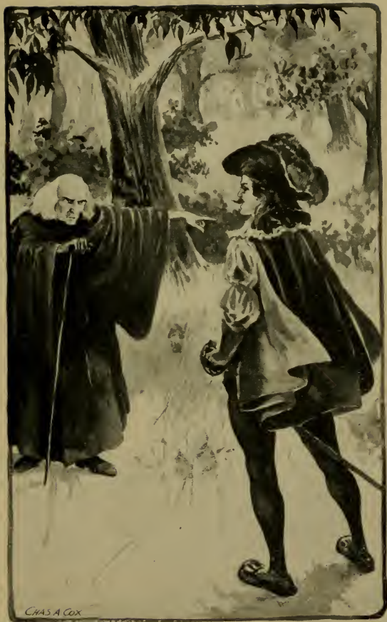
"Acquiescingly I did turn as he pointed."—Page 257. Browning's Poems,