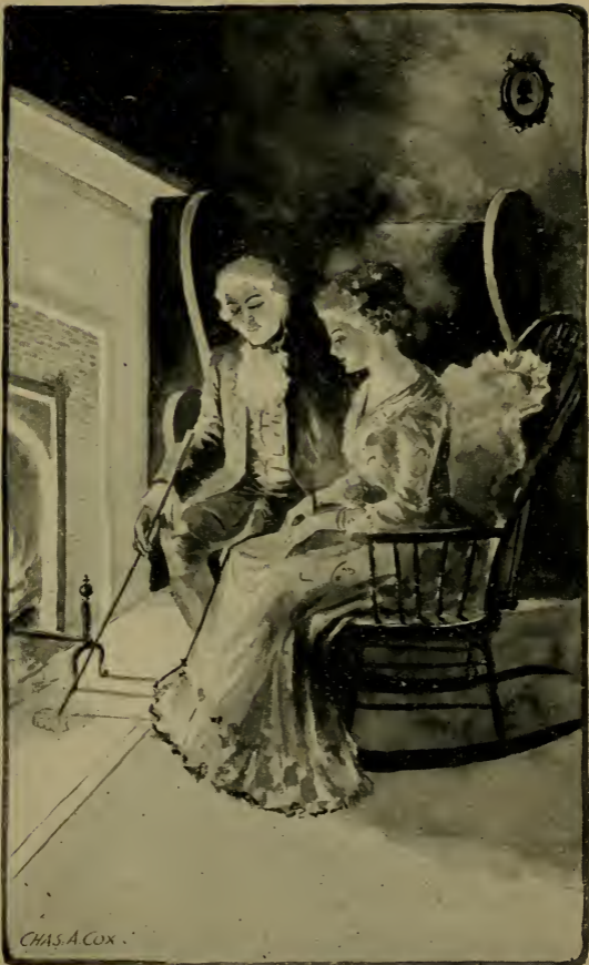
"We would try and trace one another's face."—Page 84. Drowning's Poems.