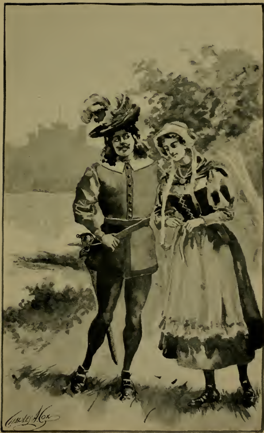
"We conferred of her own prospects."—Page 171. Browning's Poems.