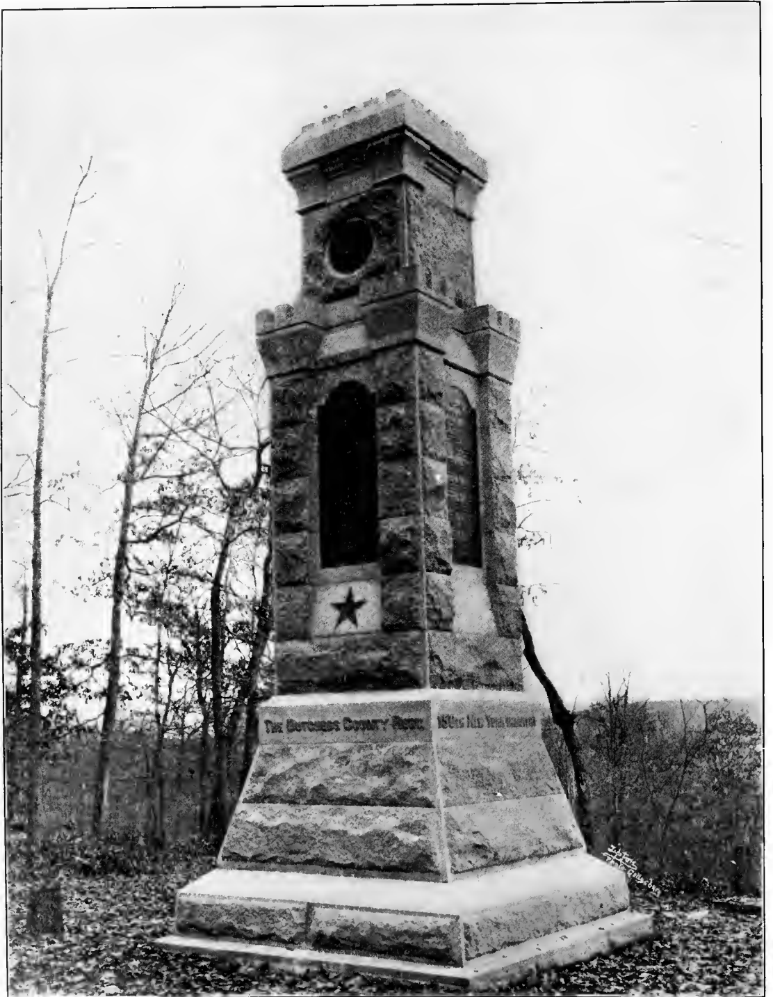
MONUMENT AT GETTYSBURG.