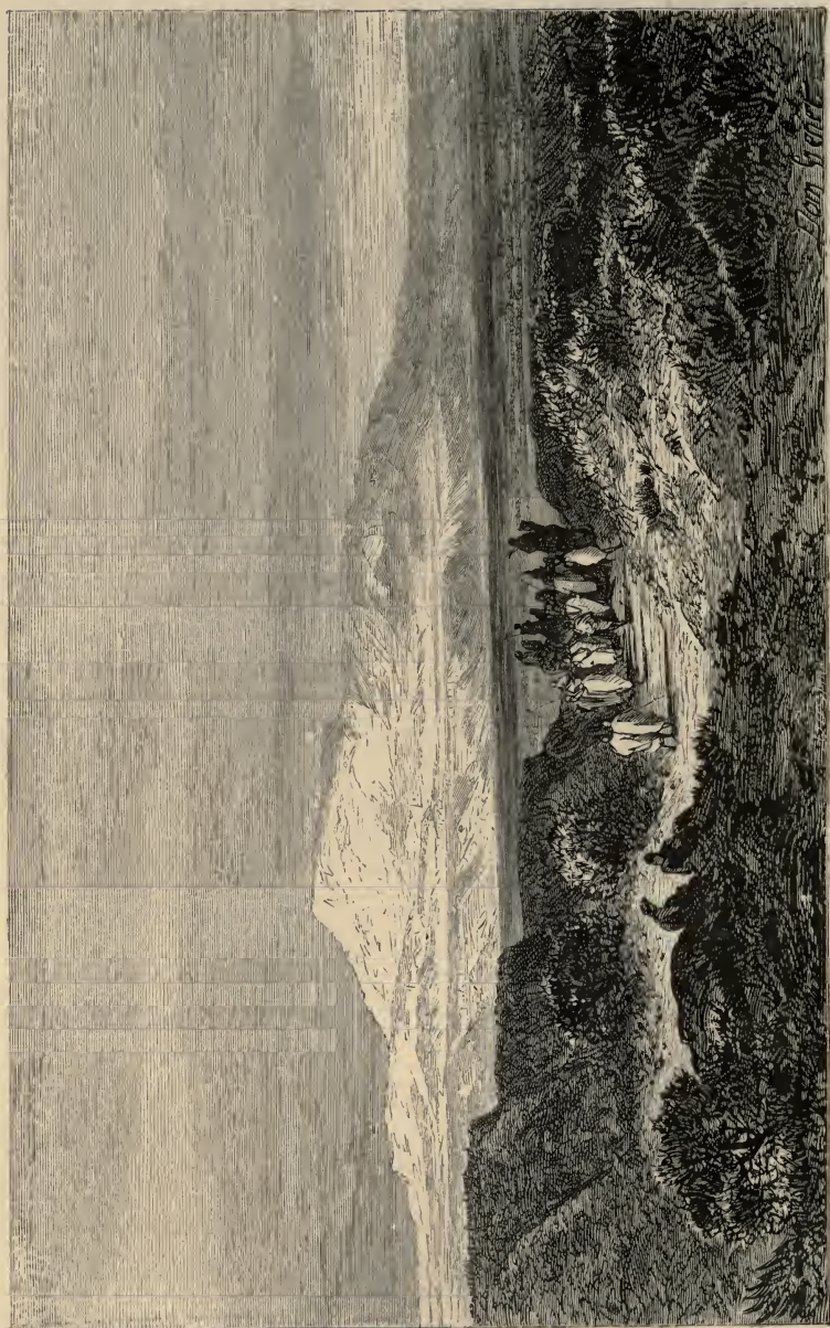
VIEW NEAR LAKE TIMSAH.