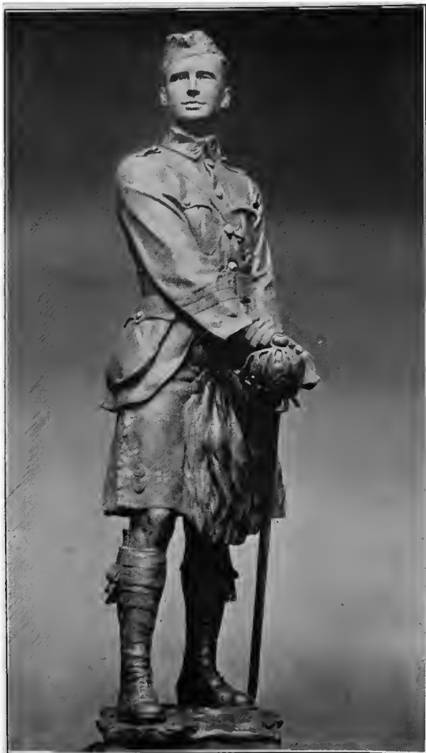
R. Tait McKenzie, Sculptor