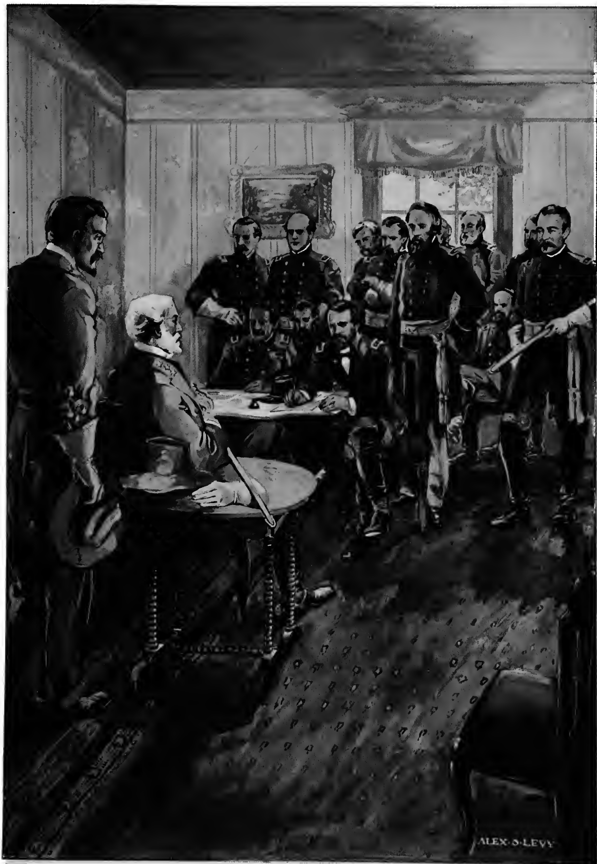
THE SURRENDER OF GENERAL ROBERT E. LEE