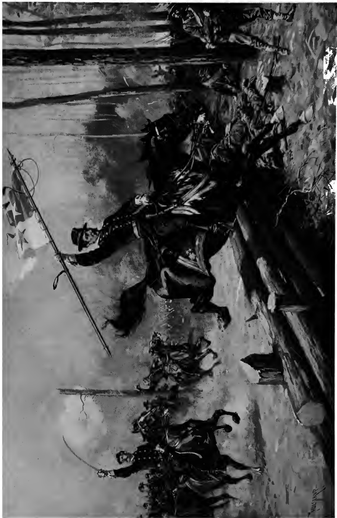
GENERAL PHILIP H. SHERIDAN

MOUNTED ON HIS FAMOUS HORSE, RIENZI, TURNING AN IMPENDING ROUT TO VICTORY AT THE BATTLE OF FIVE FORKS, APRIL 1, 1865