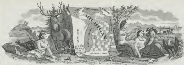
THE CALVERT LITHOGRAPH.