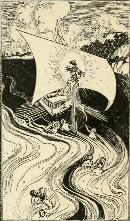
ARGO between SCYLLA and CHARYBDIS