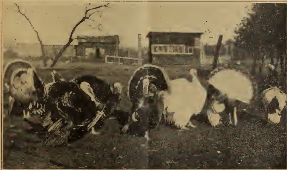
"ON PARADE" At the Kempley Turkey Ranch, near Montello, Wisconsin, where the four popular breeds: Bronze, Narragansett, Bourbon Red and White Holland turkeys are produced in large numbers and high quality, for both market and exhibition purposes.

"A Monthly Magazine Dedicated to the Progress of the Turkey Industry" 3