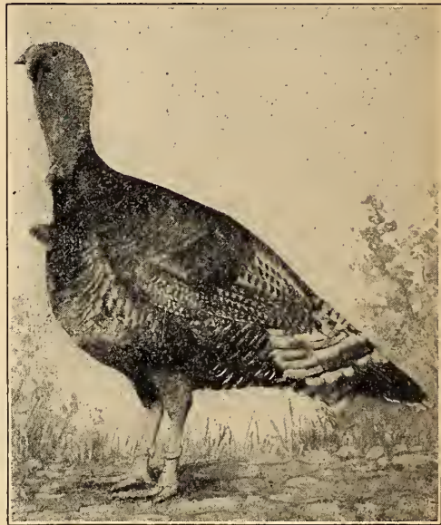
Grand Champion International Turkey Show, Chicago, 1932. (A leader in meat type; the dream of the turkey grower.)

There Are Many Grand Champions in Our Special Matings for 1935.