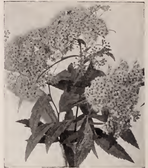
Spirea A. W.