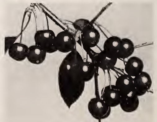
Early Richmond Cherries

3 to 5 feet, 50c each; $4.50 per 10. 2 to 3 feet, 40c each; $3.50 per 10; $30.00 per 100. GOVERNOR WOOD (Sweet). Medium size, pale yellow with pink flush. EARLY RICHMOND (Sour). Medium size, bright red. Ripens last of May. LARGE MONTMORENCY (Sour). Larger than Early Richmond and ripens about ten days later. Bright red. BLACK TARTARIAN (Sweet). Fruit large, black, heart-shaped.