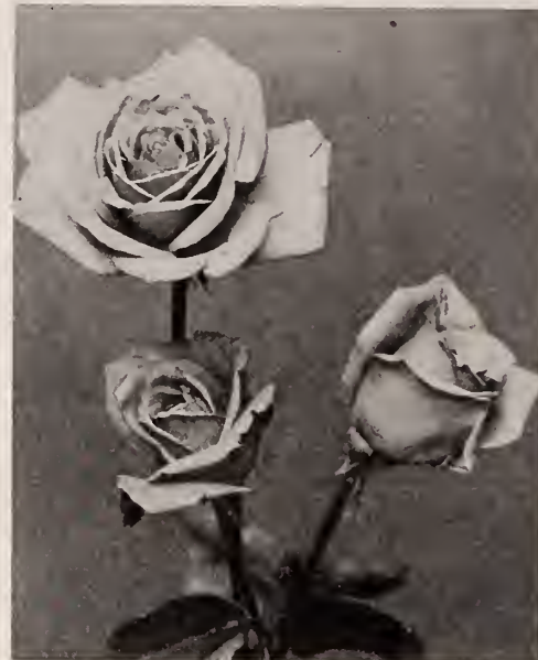
Pink Radiance Roses

MARECHAL NIEL. Strong growing climber, large, golden yellow flower. Price, 75c each. SOUVENIR DE CLAUDIUS PERNET. Large, full, sunflower yellow deepened near center. Very desirable. Price, 85c each. TALISMAN. Long, shapely bud; double flowers; a gorgeous blending of apricot, gold, yellow and rose, with outside of petals stained with streaks of red. Free bloomer and one of the newer varieties. Price, 85c each. PRESIDENT HERBERT HOOVER. Of recent introduction. Large flowers, thick petals; in color a blending of pink, flame, scarlet and yellow. Holds color well and is really an outstanding variety. Price, 85c each.