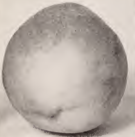
Belle of Georgia Peach

4 to 5 feet, 35c each; $3.00 per 10. 2 to 3 feet, 20c each; $1.50 per 10; $12.50 per 100. MAYFLOWER. Medium size, red skin, firm flesh. Freestone. EARLY ROSE. Early. Fruit fair sized, highly colored. Cling.