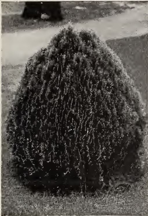
Dwarf Golden Arbor-Vitae