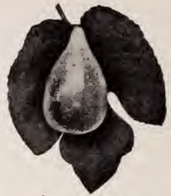
Brown Turkey Fig

4 to 5 feet, 60c each; $5.00 per 10. HICKS. Most popular of all. Fruit black, sweet and well flavored.