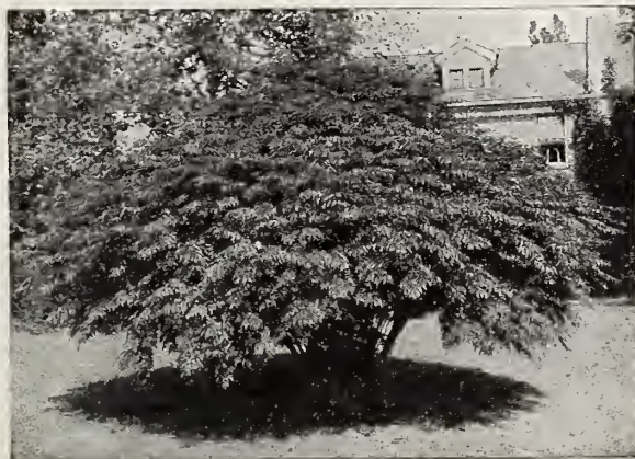
Texas Umbrella Tree

WEeping MULBERRY. Small tree of drooping habit of growth. Long, graceful branches curving to the ground. Fine for specimen planting. Price, Two-year heads, $1.75 each.