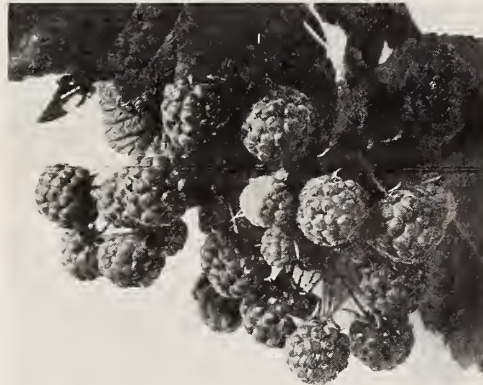
St. Regis Raspberries

PRICES: 70c per 10; $6.00 per 100 EARLY HARVEST. Extra early. Medium sized berries of good quality. ELDORADO. Large, sparkling black fruit. Very sweet.