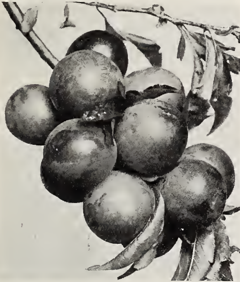
Red June Plums

4 to 5 feet, 40c each; $3.75 per 10. 2 to 3 feet, 20c each; $1.75 per 10; $15.00 per 100. WILD GOOSE (Native). Medium sized fruit, bright red and richly acid. Ripens before the Japanese varieties. RED JUNE (Japanese). Medium size, dark red. Flesh light yellow. ABUNDANCE (Japanese). Large, amber color changing to red. BURBANK (Japanese). Fruit large. Skin deep red overlying yellow ground. SHROPSHIRE DAMSON. Well known. Purple skin, amber flesh. COMPASS CHERRY PLUM. Fruit small, bright red. Excellent for canning.