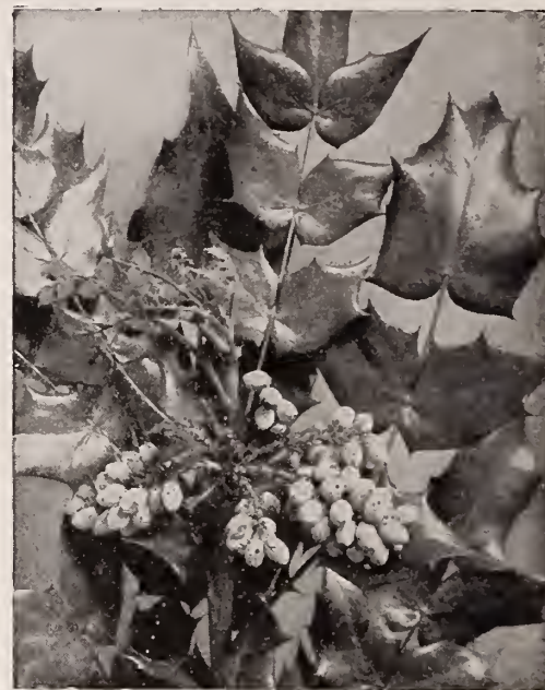
Mahonia or Hollygrape

PITTOSPORUM, TOBIRA. A popular shrub for Southern planting. Compact habit of growth, dark green leaves clustered at the ends of the branches. Yellowish-white flowers in early Spring. Valuable for foundation planting. Price, $1.25 each. PYRACANTHA LALANDI. Dwarf growing shrub, slender branches. Foliage dark green, white flowers borne in clusters followed by orange colored berries. Price, $1.25 each.