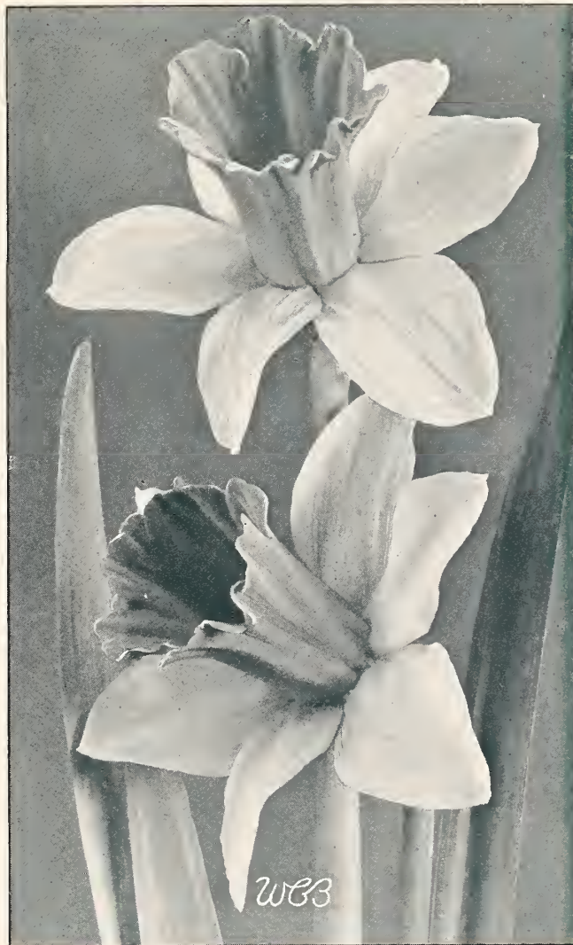
Giant Trumpet Daffodil