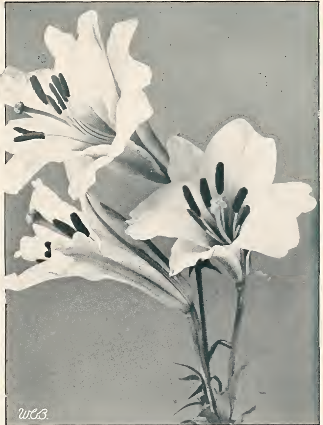
Lilium Regale, the Regal Lily