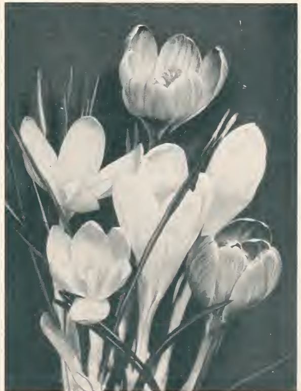
Crocus from Our Mammoth Bulbs