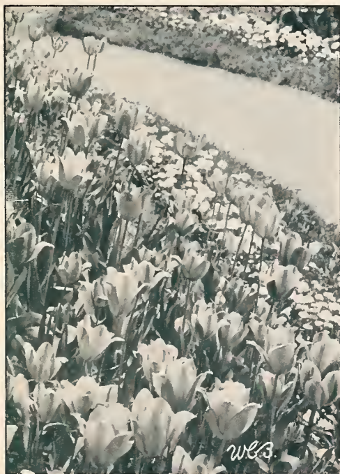
Bed of Cottage Tulips

F. F. Rockwell's book of Bulbs is the completest exponent on bulb culture, giving accurate description of varieties, culture, and making its 264 pages well worth the price, $3.00.