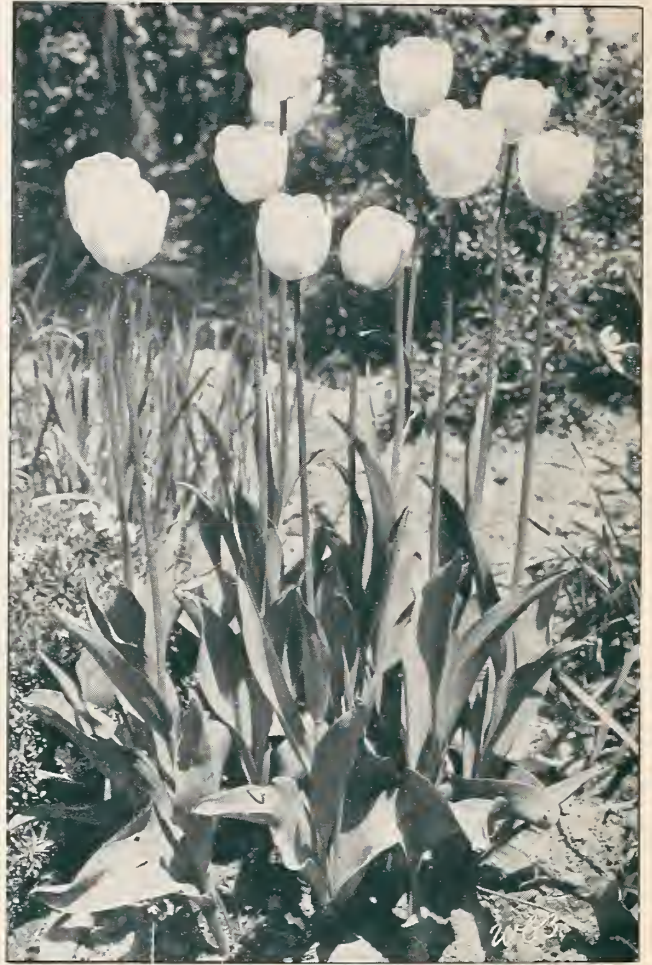
Darwin Tulip, Clara Butt