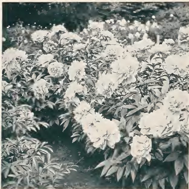
A Bed of Therese Peonies

Those who are fond of Peonies will be delighted with these modern marvels which the skill of the hybridizer has given us. They will thrive in almost any situation, but prefer a sunny spot and medium heavy, but well-drained and fertilized soil. Plant them 3 to 4 feet apart and with the crown of the root 4 or 5 inches below the surface level. Give extra attention to cultivation the first two years after planting and, if you want the finest specimen plants, pinch off all buds which appear before the third season. Plenty of moisture is required during the blooming period. We offer ten of the finest standard varieties in cultivation.