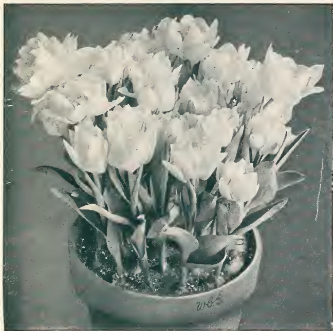
Double Early Tulips