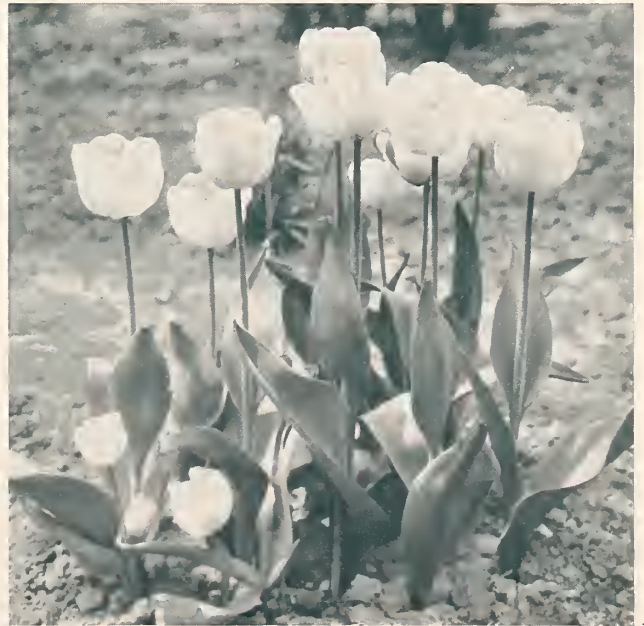
A Cluster of Beautiful Darwin Tulips