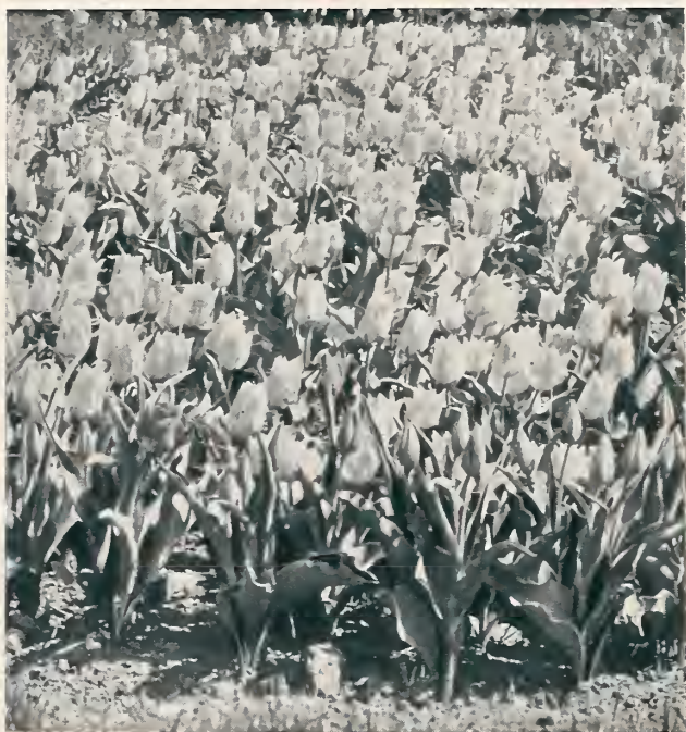
Single Early Tulips