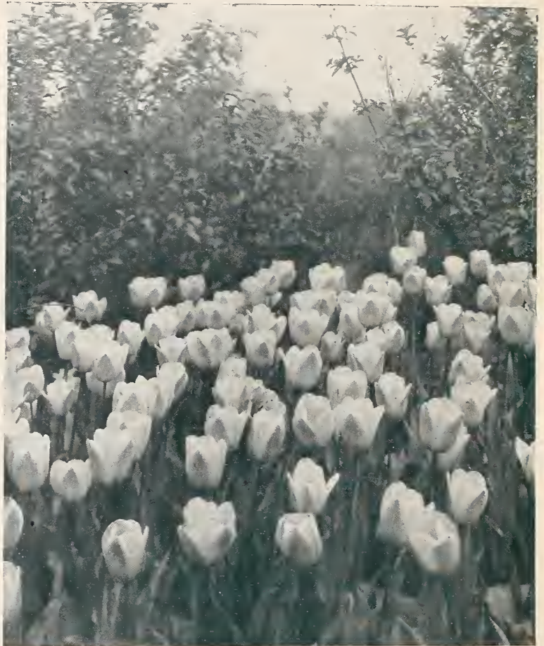
Planting of Breeder Tulips