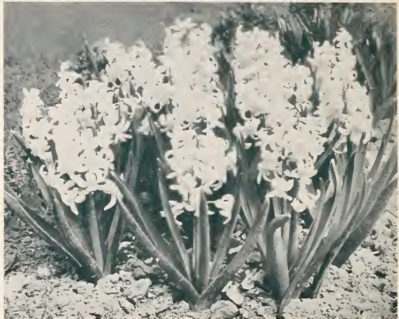
Beautiful Bed of Beckert's First-Size Hyacinths

First-Size Hyacinth Bulbs—any of the above—35 cts. each, $3.50 per doz., $24.00 per 100 (postage extra)