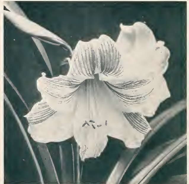
Beckert's Superb Hybrid Amaryllis

on strong, stiff stems 8 to 12 inches long. $1.00 doz., $7.00 per 100.