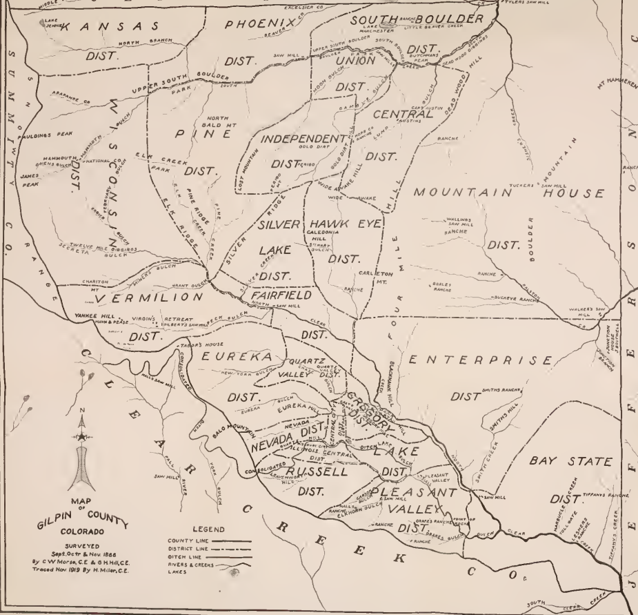
MAP OF GILPIN COUNTY COLORADO