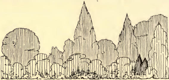
STUDY OF ELEVATION .