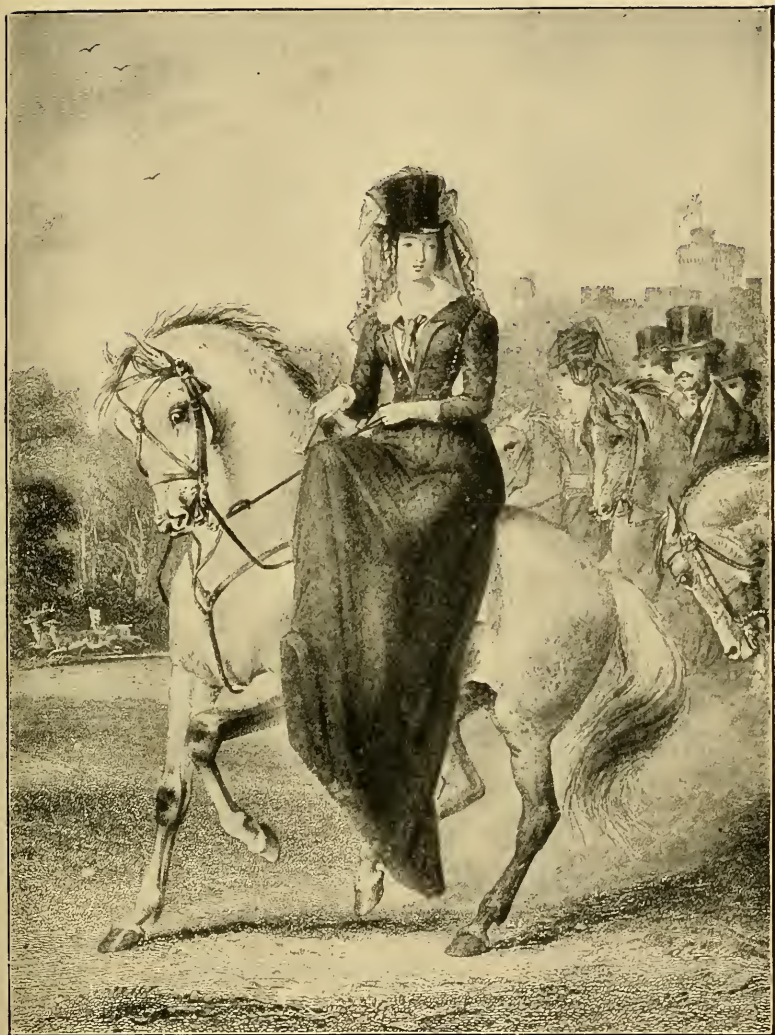
QUEEN VICTORIA IN 1838.