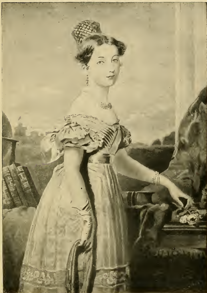
PRINCESS VICTORIA IN 1836.