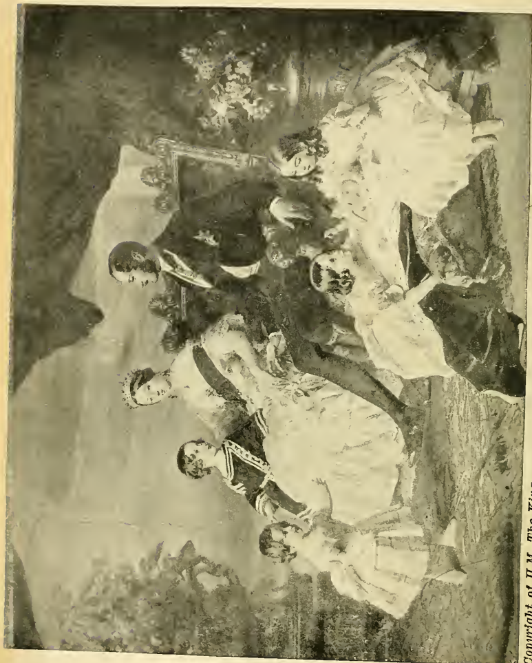
Copyright of H.M. The King.