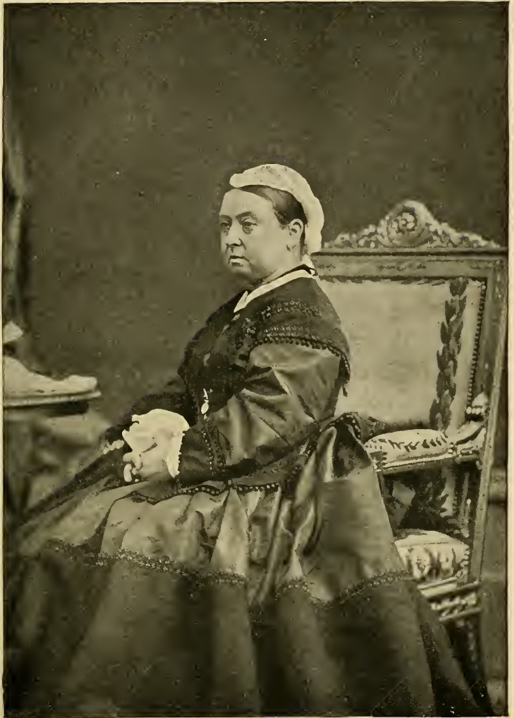
QUEEN VICTORIA IN 1863.