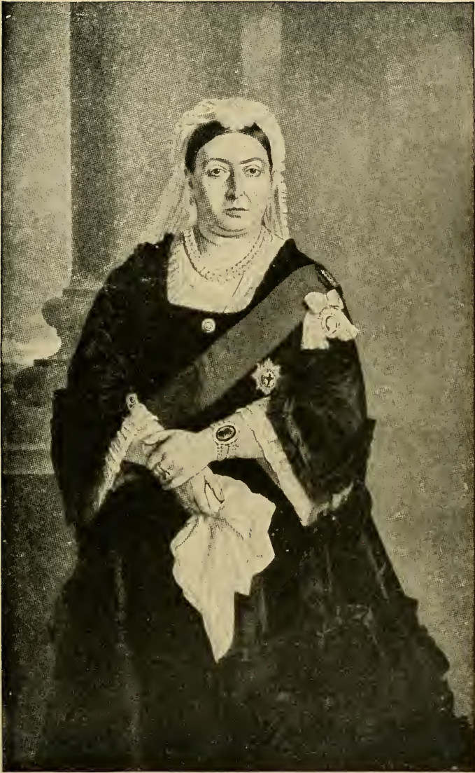
QUEEN VICTORIA IN 1876.