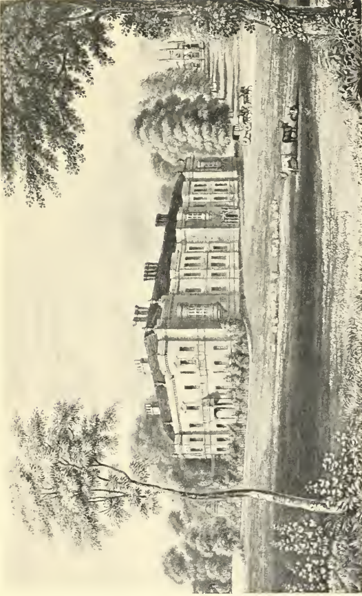
HARTWELL HOUSE, BUCKS.

(FROM N. WHITTOCK'S DRAWING, ENGRAVED BY HIMSELF)