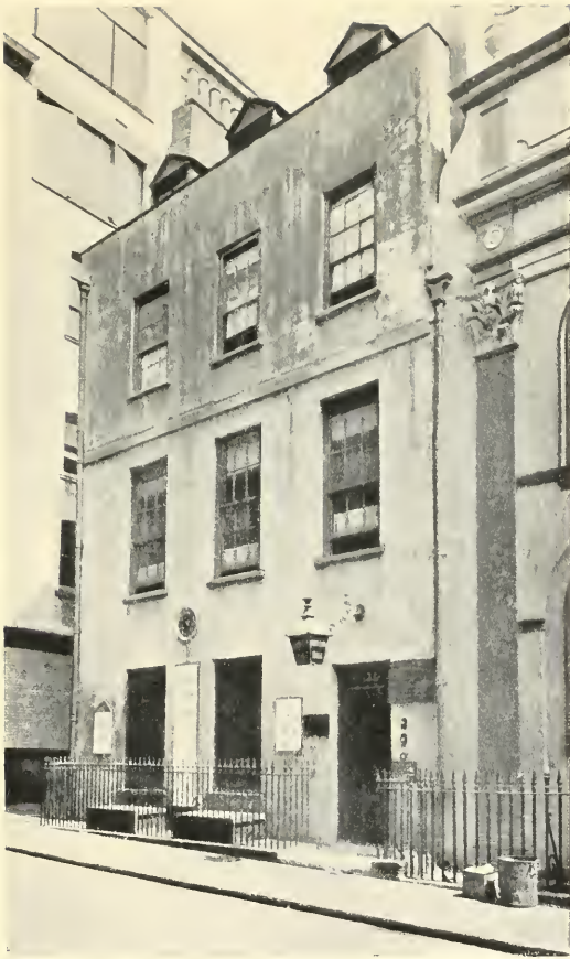
NO. 1 ST. MARTIN'S STREET (FROM A PHOTOGRAPH)