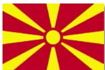
Former Yugoslav Republic of Macedonia

Country participation in Saber Guardian are subject to change.