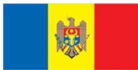
Republic of Moldova