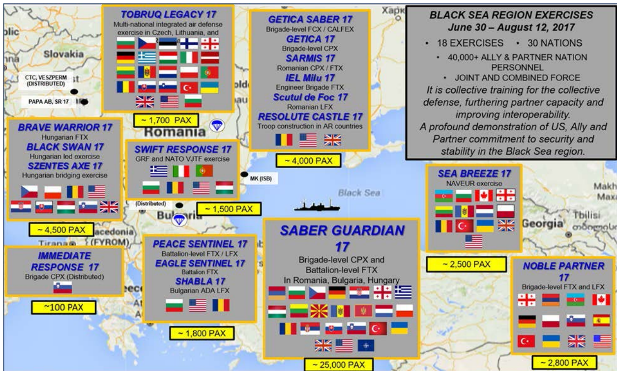
Countries participation in exercises are subject to change.

In total, 18 exercises occur in the Black Sea Region in the summer of 2017. Saber Guardian 17 (SG17) is the largest of the Black Sea Region exercises and is enabled by several smaller Bulgarian, Hungarian, Romanian and U.S. exercises. Approximately 40,000 troops from 30 countries' will participate in these exercises in the Black Sea Region. It is collective training for the collective defense, furthering partner capacity and improving interoperability; a profound demonstration of U.S., Allied and partner commitment to security and stability in the Black Sea Region. Each exercise is separate and distinct. Some exercises contribute to or enable SG17 in various ways, while other exercises simply run concurrently, or overlap with but have no relation to SG17.