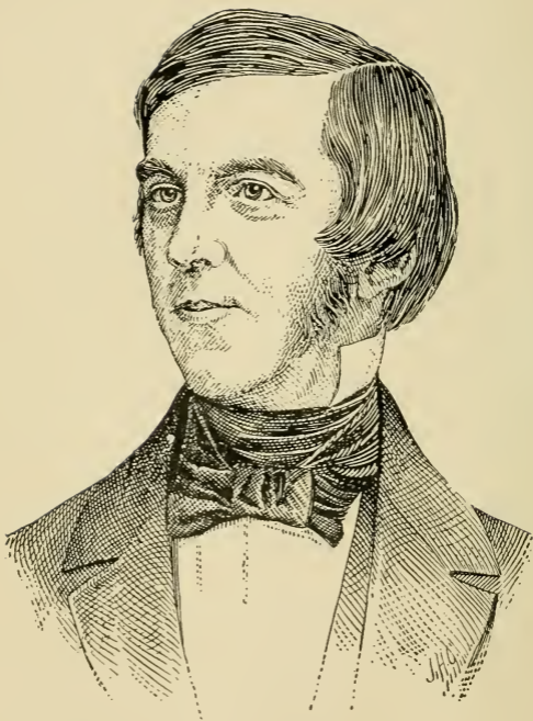
OLIVER WENDELL HOLMES