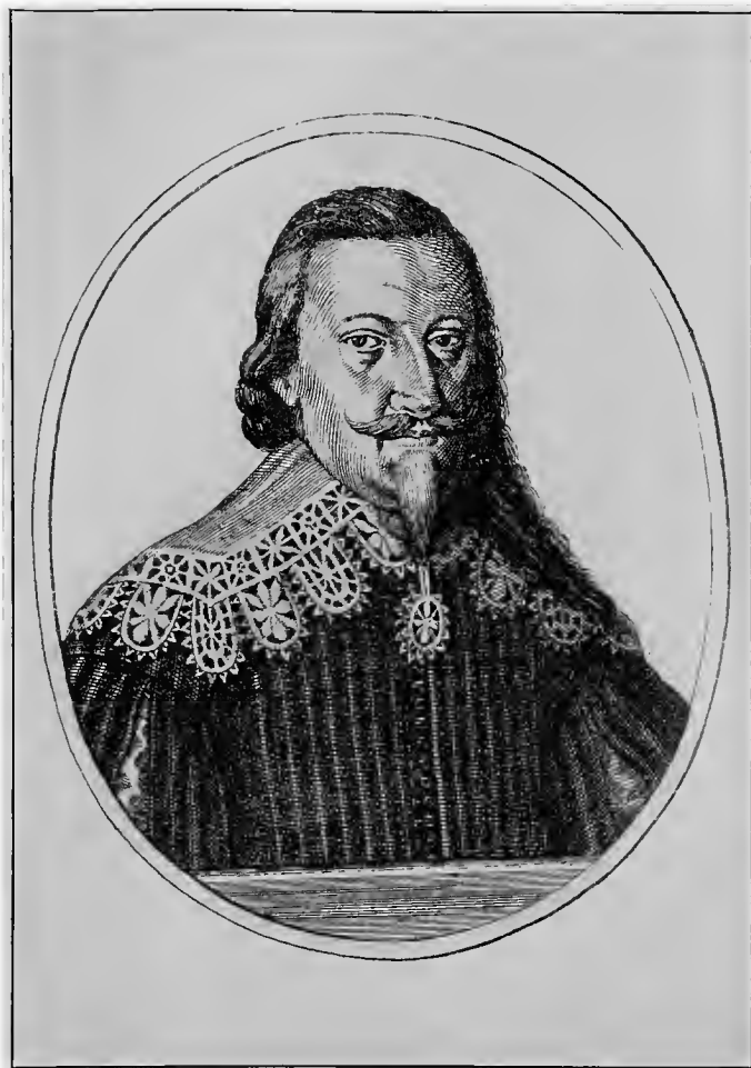
ELECTOR OF BRANDENBURG