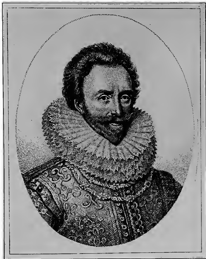
SIR DUDLEY CARLETON