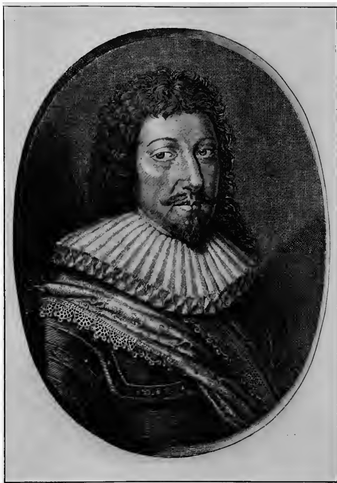
LOUIS XIII OF FRANCE