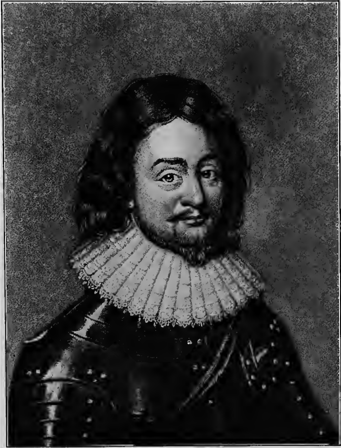
FERDINAND, KING OF BOHEMIA