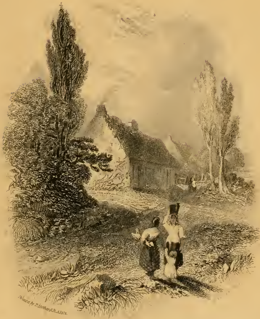
The Birth place of Burns.