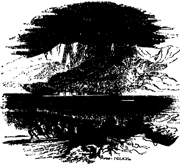
CASTLE OF TATANG.

were yet existing, and the nawâb has often assured me it employed more labour to remove them than was required to raise the new castle. A superior castle, with very lofty walls and towers, has been erected. To the east, or front, is a large public garden, with handsome summer-house and baths for the accommodation of guests, and adjoining the southern front of the building is another private garden. Both are stocked with flowers, and at this time displayed large expanses of red and white tuberose. In the evening the fragrance of the atmosphere was delightful. The trees in these gardens, as over the estate, are but young, although some of the cypresses have attained a moderate