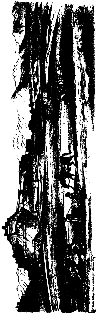
VIEW of the BALLA HISSAR BALLA or UPPER CITADEL of KÁBAL, from the SOUTH

London. Richard Bentley, New Burlington Street 1842.