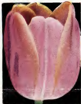
INGLESCOMBE PINK (Cottage)