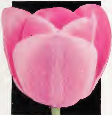
BARONNE DE LA TONNAYE

BRECK'S GOLD MEDAL MIXTURE OF NAMED DARWIN TULIPS, all colors, our selection. . . . $1 00 $7 00 $65 00 BRECK'S SELECTED MIXTURE OF DARWIN TULIPS . . . 60 4 00 35 00