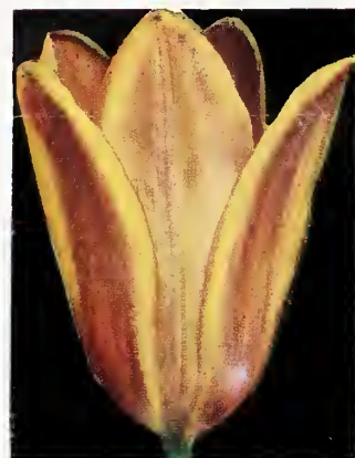
HAMMER HALES (Cottage)