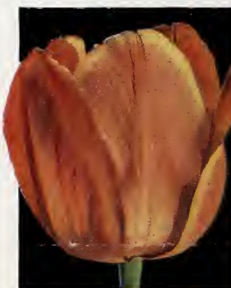
BRONZE QUEEN (Breeder)