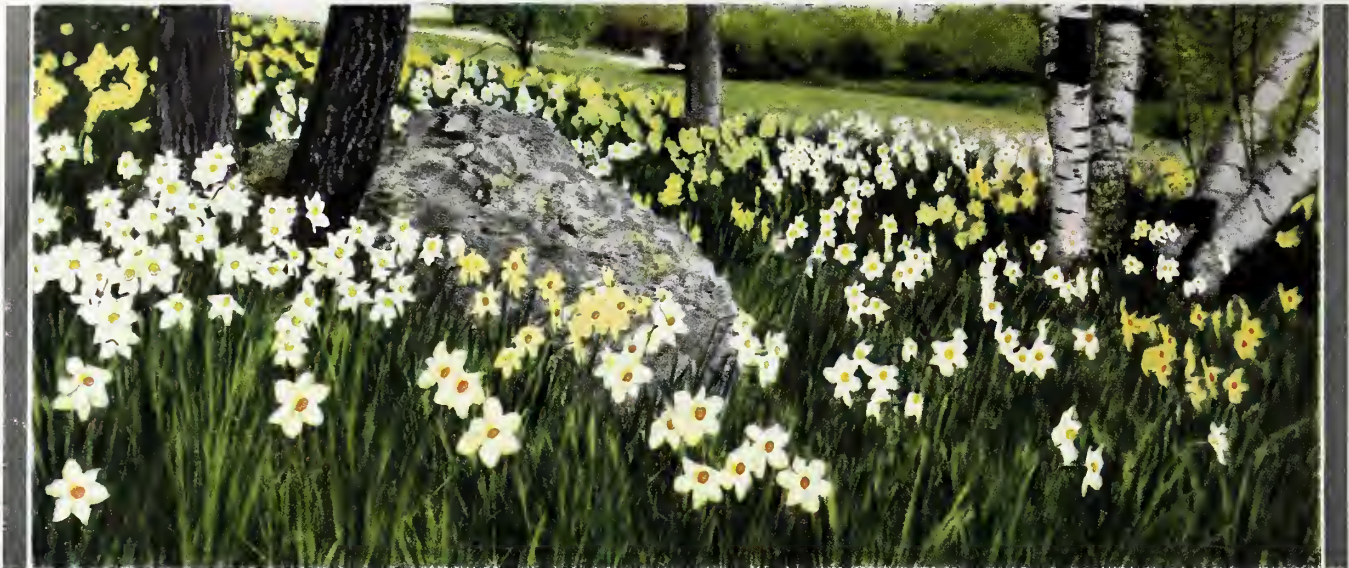
NATURALIZED NARCISSUS MAKE THE WOODS AND MEADOWS GAY