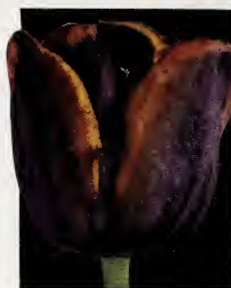
LOUIS XIV (Breeder)