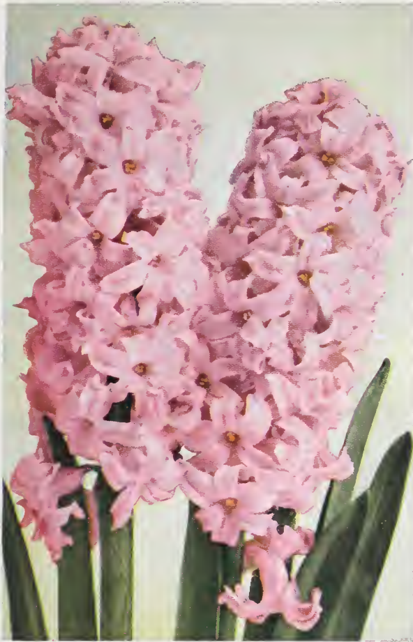
GERTRUDE IS A FINE PINK HYACINTH

25 Bulbs Each of 10 Varieties (250 bulbs in all) $10.00