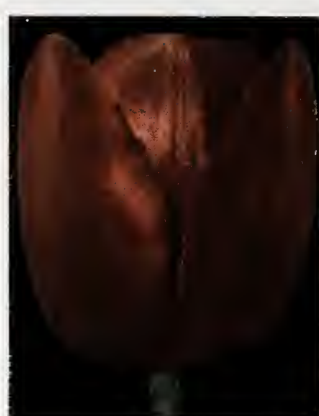
DOM PEDRO (Breeder)