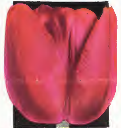
PRIDE OF HAARLEM