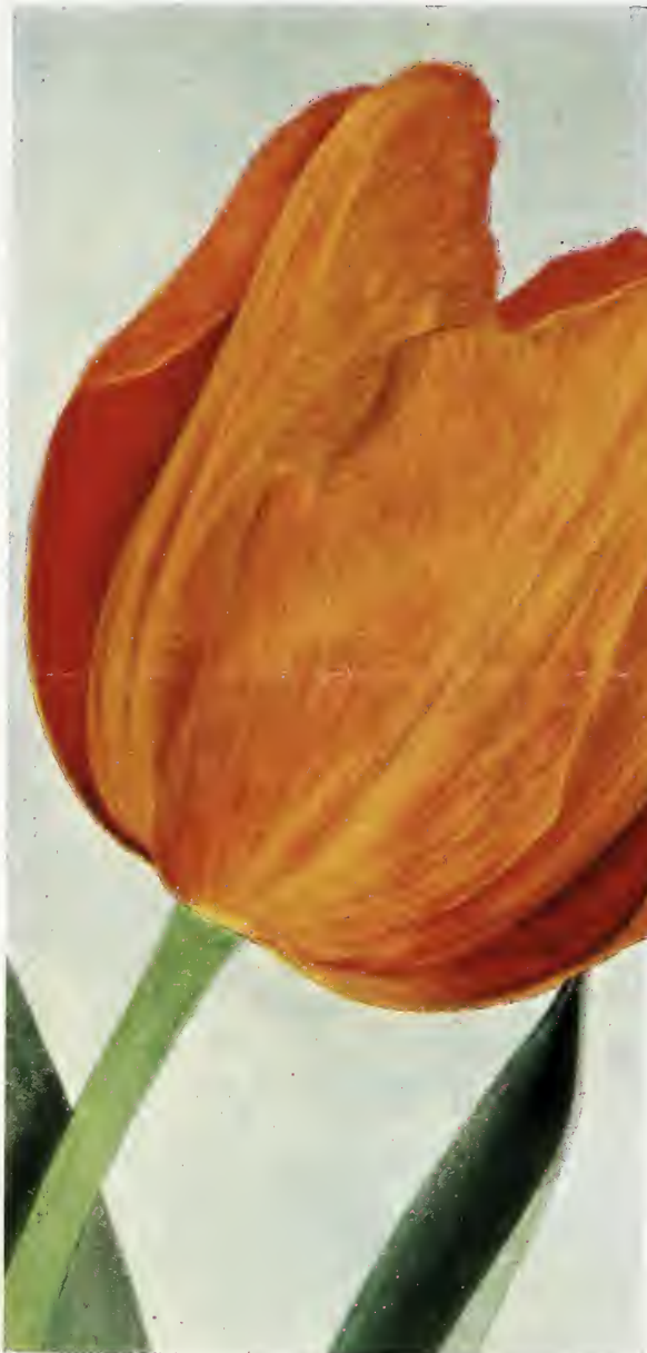
SINGLE EARLY TULIP, DE WET