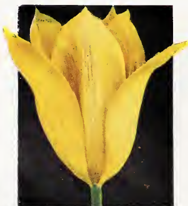
MRS. MOON (Cottage)