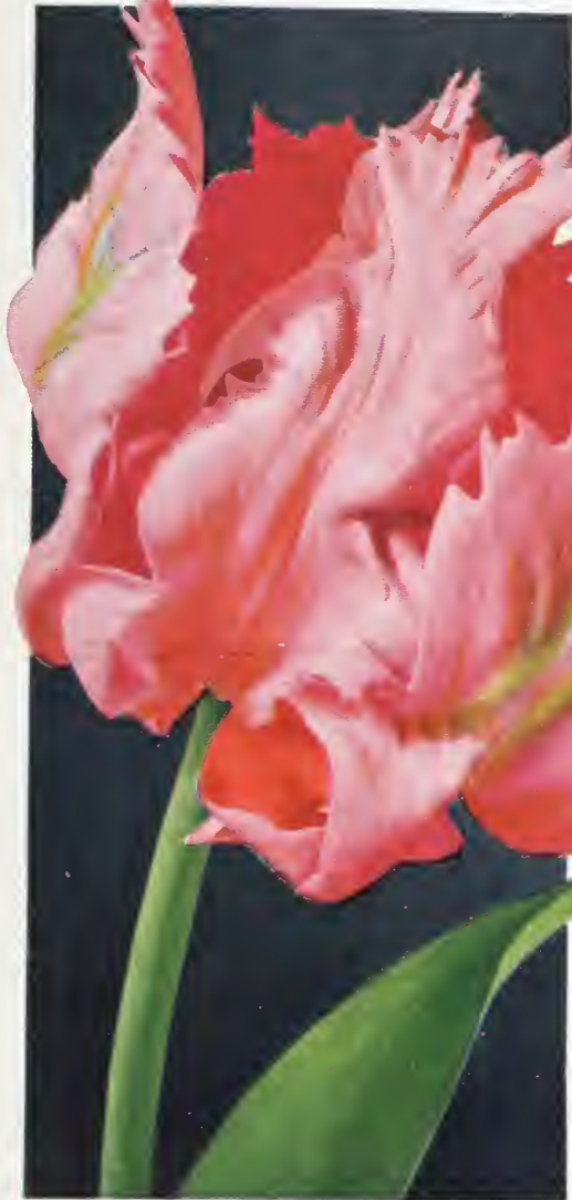
PARROT TULIP, FANTASY