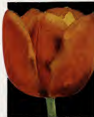
PRINCE OF ORANGE (Breeder)