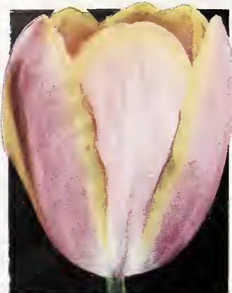
JOHN RUSKIN (Cottage)