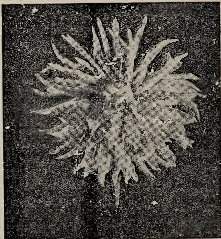
GRAND SLAM (S.C.) 1936

DIVIDING THE CLUMPS —In the Spring as soon as the eyes or sprouts begin to show the clumps should be divided. To do this, first split the clumps by cutting through the stalk with a good strong pocket knife or short bladed butcher knife if you have one. Then cut each half in two, trying to divide the bulbs so that each one will have a piece of the stalk with an eye or sprout attached to the bulb. The eyes are all formed around the base of the stalk there being none on the bulbs, so in dividing, great care must be used to see that each bulb has a piece of stalk with an eye on it attached to the bulb, otherwise they will not grow.