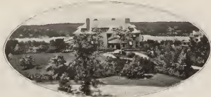
Pillinthea Smith's Point, Manchester, by the Sea.