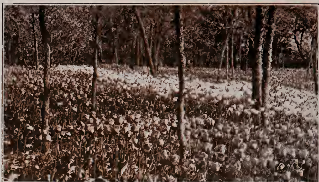
ONE OF OUR LOCAL TULIP PLANTINGS.