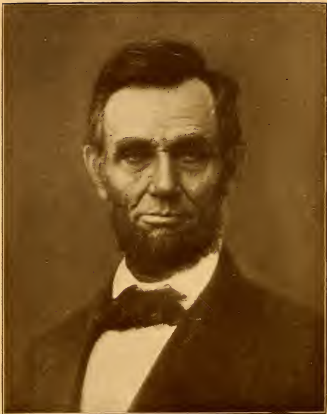
ABRAHAM LINCOLN From a photograph (probably 1864)