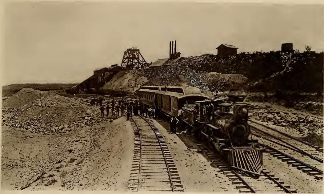
GENERAL VIEW OF THE COAHUILA COAL MINES, HONDO, MEXICO.