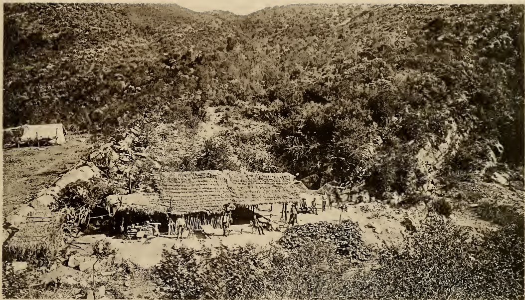
“HOTEL RECTOR,” SAN LUCAS SPRINGS, MEXICO. (THESE SPRINGS EFFECT MOST WONDERFUL CURES.)