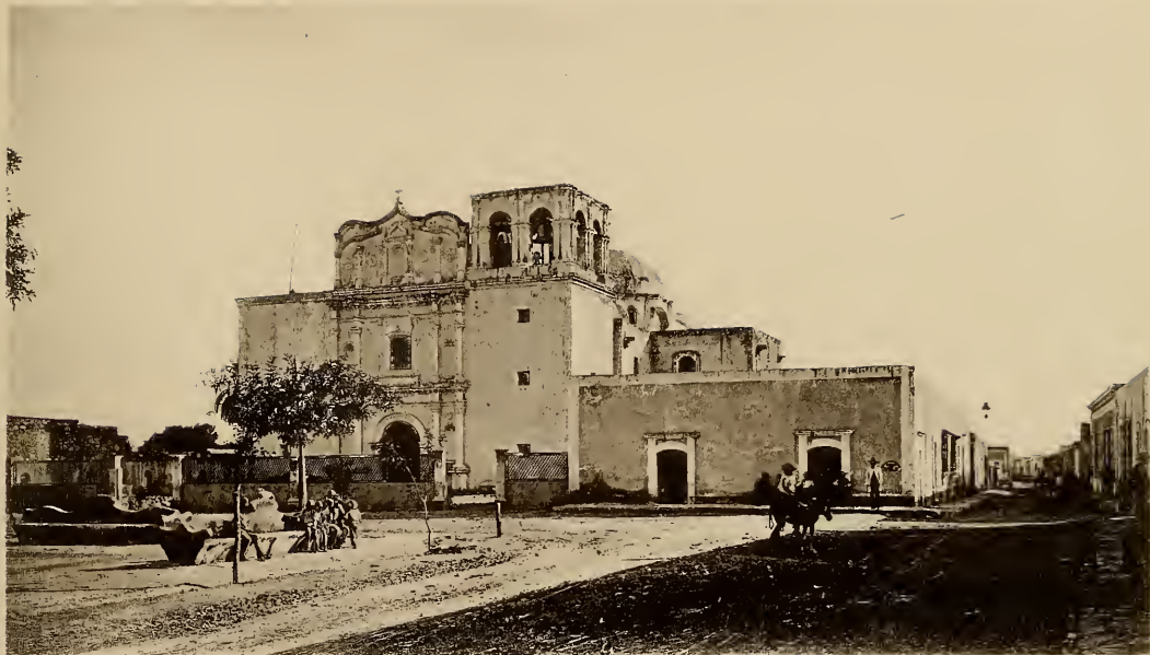
THE CATHEDRAL, MONCLOVA, MEXICO. (THIS RANKS WITH THE OLDEST IN THE REPUBLIC.)