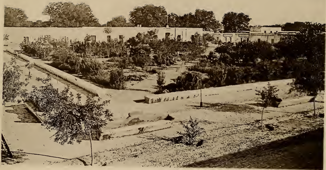
THE PLAZA, MONCLOVA, MEXICO.