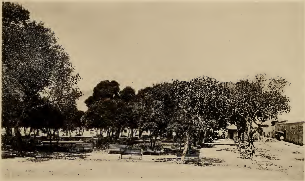
THE PLAZA, PARRAS, MEXICO.