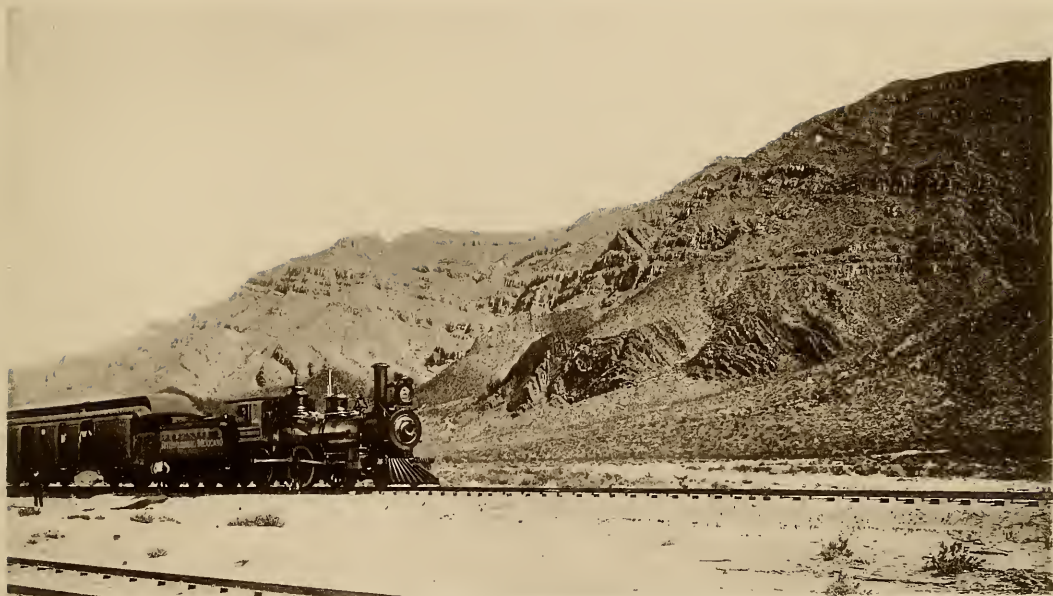
MOUNTAIN SCENE NEAR MAYRAN STATION.