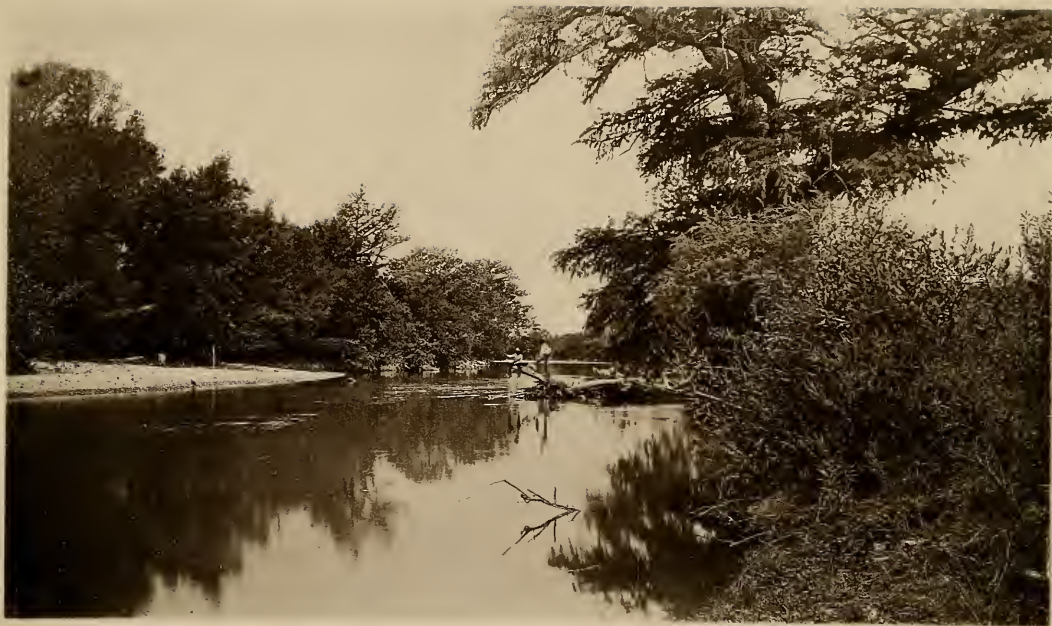
VIEW ON THE SABINAS RIVER—ABOVE THE RAILWAY BRIDGE.