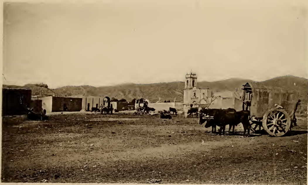
"CHURCH DE LA MADERA,"