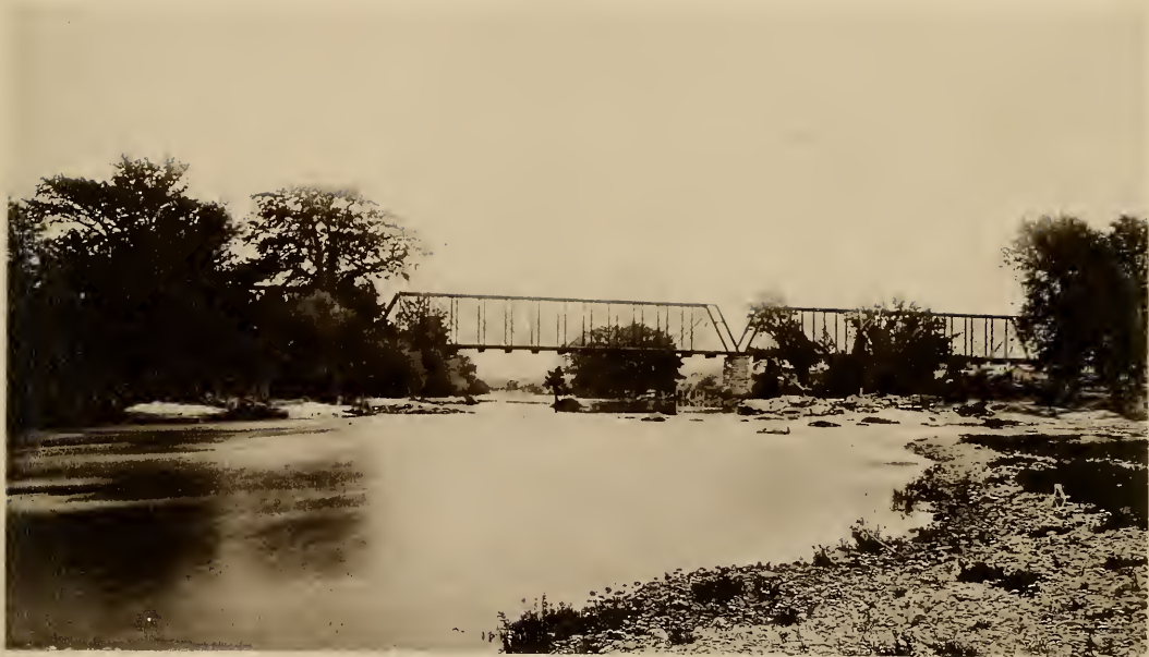
THE RAILWAY BRIDGE ACROSS THE SABINAS RIVER, SABINAS STATION.