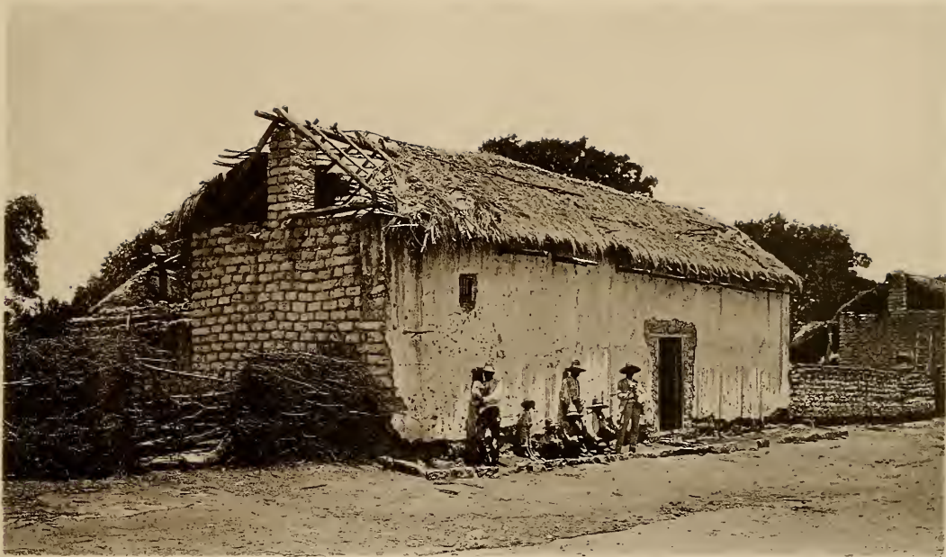
A MEXICAN JACAL. SANTA ROSA, MEXICO.