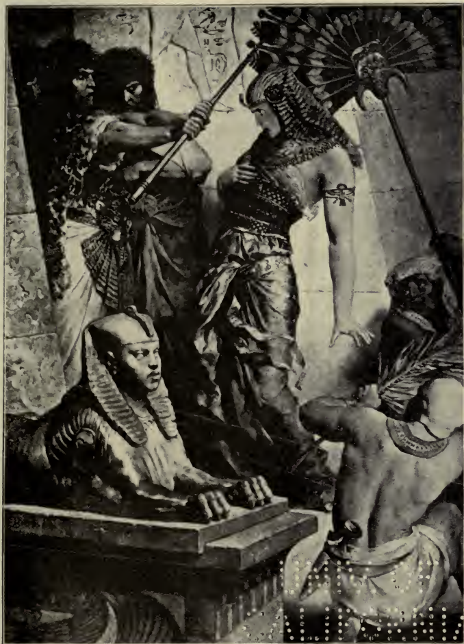
AMENI REFUSED ADMISSION TO THE TEMPLE BY BENT-ANAT.