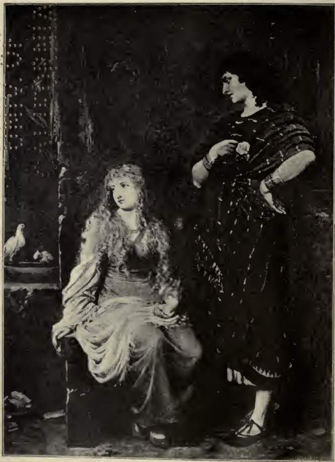
UARD A AND RAME RI.