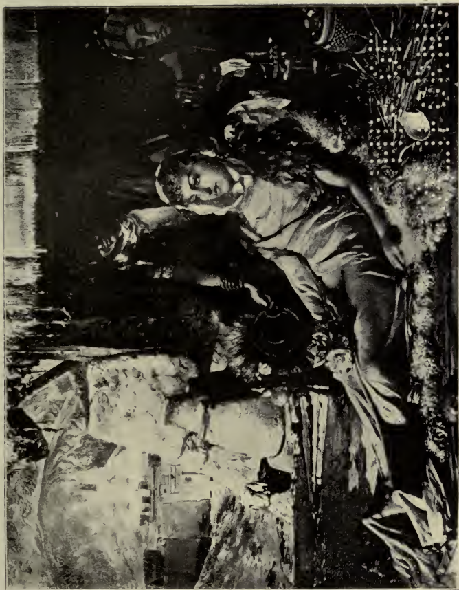
UARDA ATTENDED BY THE PHYSICIAN.