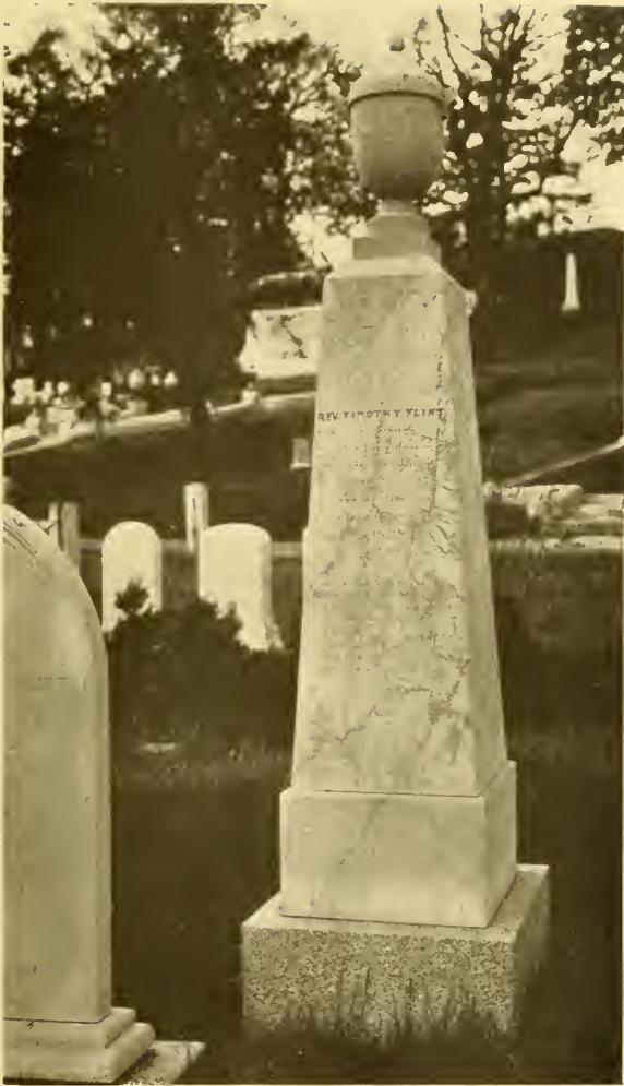
TIMOTHY FLINT'S MONUMENT, HARMONY GROVE CEMETERY, SALEM, MASSACHUSETTS