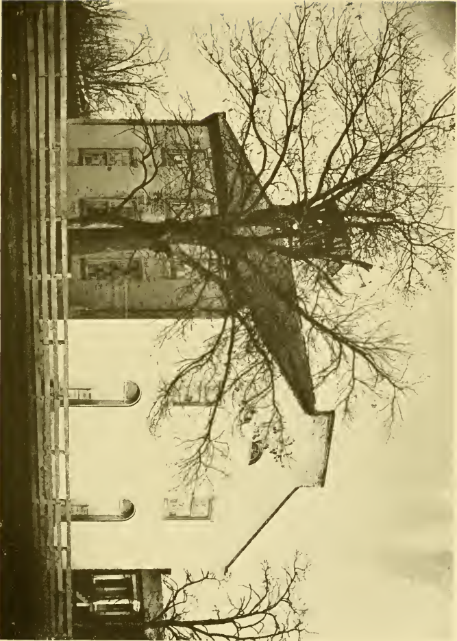
PRESBYTERIAN CHURCH, ST. CHARLES, MISSOURI Built about 1819