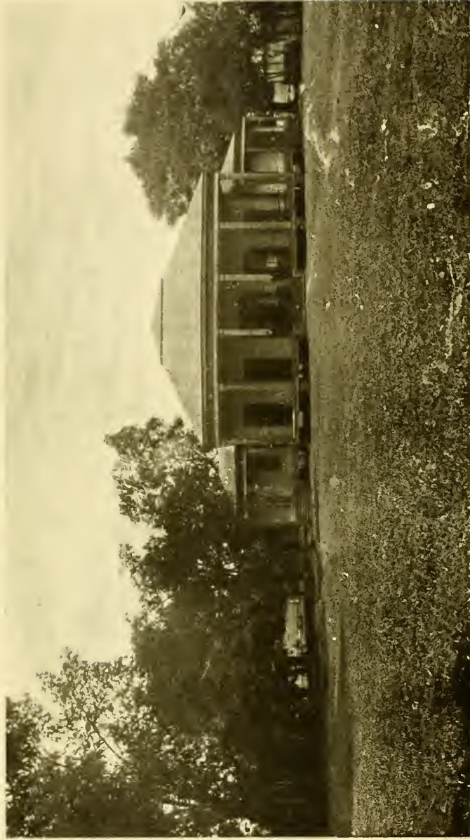
THE FLINT HOMESTEAD, ALEXANDRIA, LOUISIANA