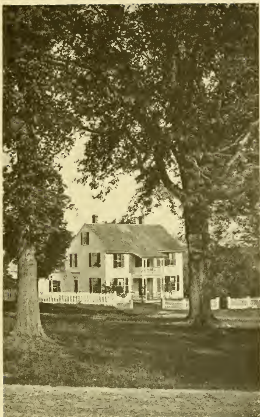
THE PARSONAGE AT LUNENBURG, MASSACHUSETTS Slightly altered in recent years