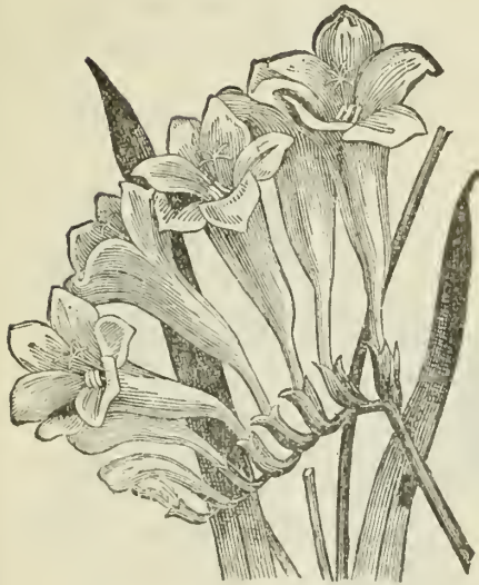
FREESIA REFRACTA ALBA.

Apply for above at once. Samples sent out.