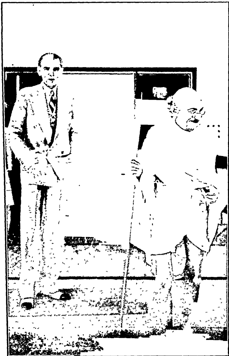
Qaid-e-Azam and Mr. Gandhi before proceeding to meet the ex-Viceroy, Lord Linlithgow.