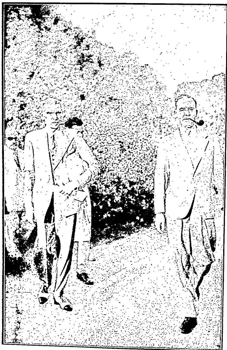
Qaid-e-Azam and Sir Stafford Cripps after their meeting in 1942.