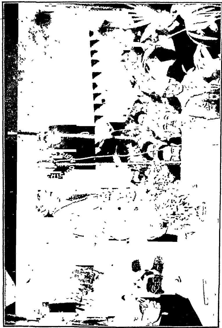
Qaid-e-Azam addressing the open session in the Islama College, Lahore at the Special Pakistan Conference