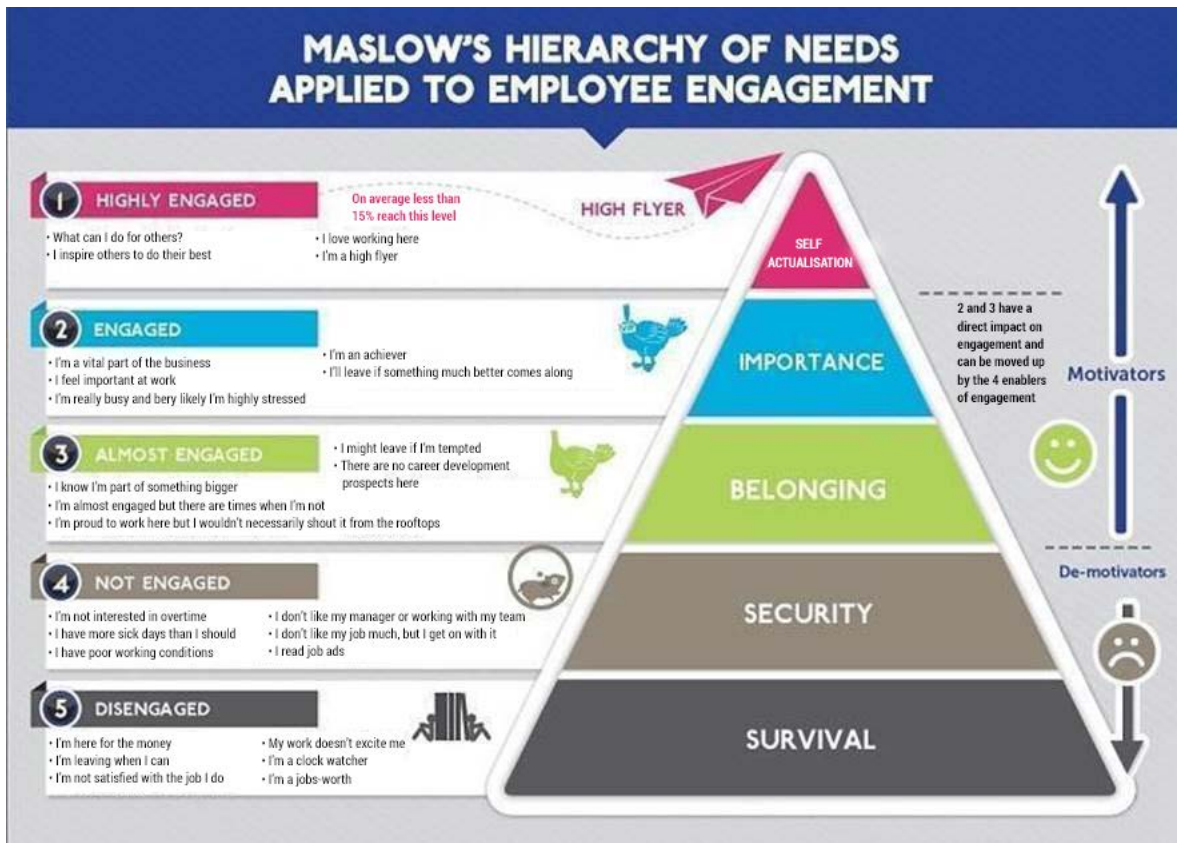
Figure 3. LoyaltyWorks-Employee Engagement Psychology Model 45

The displayed OCB examples of (Figure 2) must be carefully balanced as both positive and negative outcomes are possible. The dangers of over commitment can form a tainted relationship with the firm (perception of undervalued) just as underperformance may cause harm to the employees’ role in the organization. When combined with Maslow’s Hierarchy of Needs through the Loyalty Works Model of Employee Engagement (Figure 3) demonstrated engagement occurs at all levels, from survival (organizational entry) to self-actualization (true ownership). 44